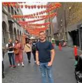
Chinatown in London