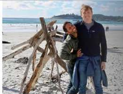
The beach is one of our favorite places