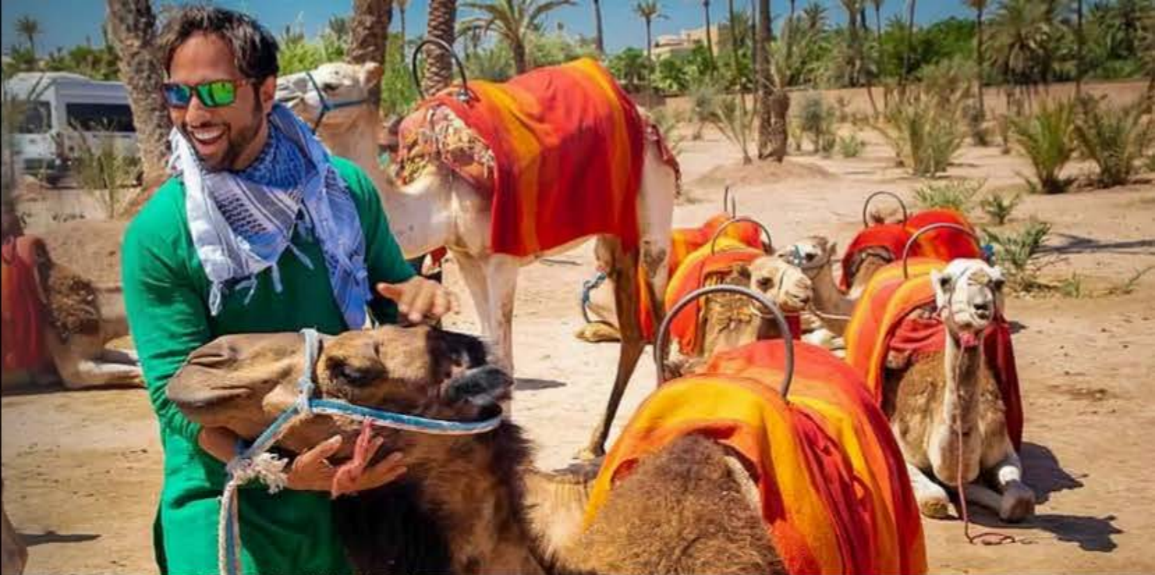
Petting Hasan the camel in Morocco

Since my parents immigrated here from northern India, I didn't learn English until I was in school, so I always found it tough growing up to collect my words. It was hard to make friends so I engulfed myself in books and read every day. I learned to love the art of storytelling and I became a TV news anchor and reporter, traveling all over the country for NBC, CBS and ABC affiliates. Now, I work for the federal government, helping our nation's top officials tell their stories.