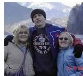
My two sisters are my closest friends