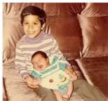
I've always been very protective of my sister Sonia