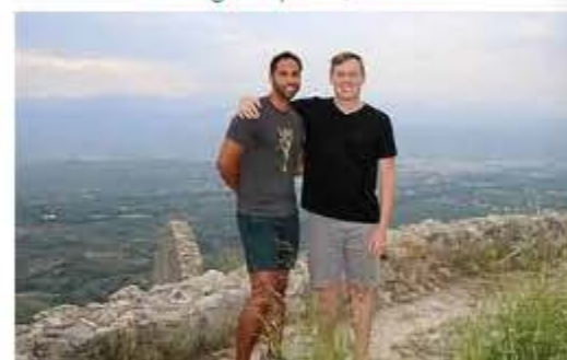
Summer in Lake Como, Italy