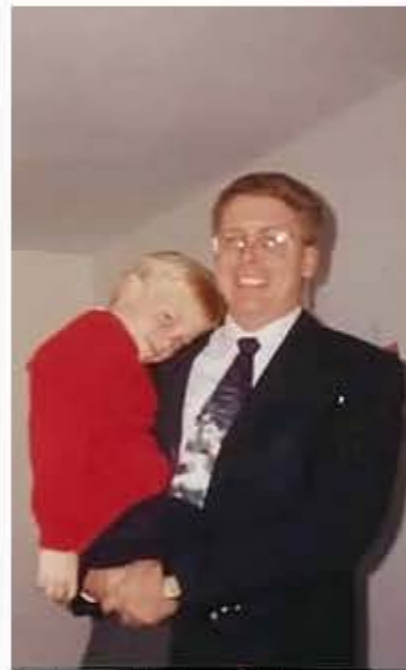
My dad and I before Christmas mass