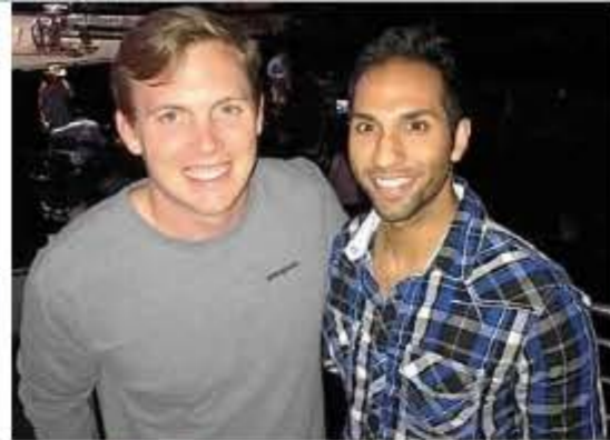
We love country music concerts