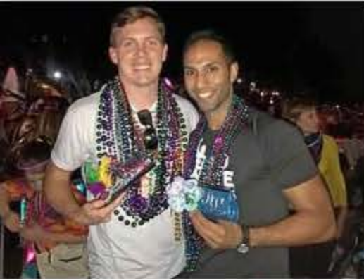
Dating during Mardi Gras