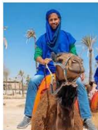
Riding camels in Marrakesh, Morocco