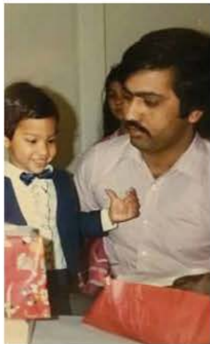
Opening birthday gifts with dad