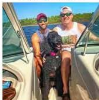
Boating in Florida