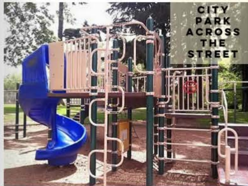
CITY PARK ACROSS THE STREET