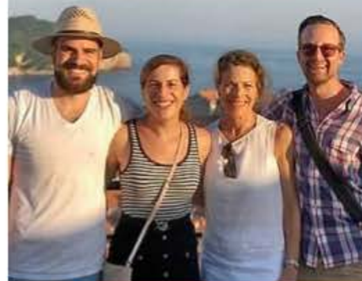
CROATIA (AND GAME OF THRONES TOUR!)