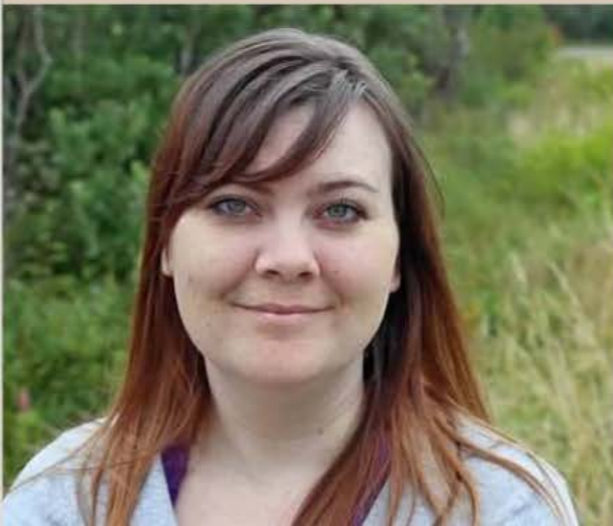
Exploring Mimna Mounds