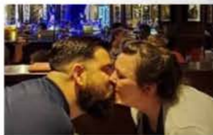
Celebrating our 20th anniversary.