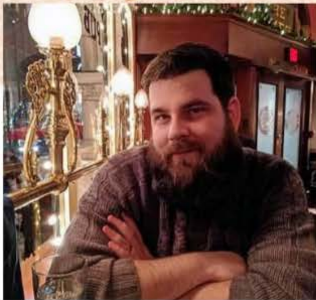
At a pub in Victoria, British Columbia

I grew up in a small bedroom community of Boise, ID. I was raised in a two-parent household with a brother and a sister, and we were all born three years apart in March. My family is originally from the midwest, but moved to Idaho when I was still an infant. I did not grow up in a very strict household as I was a latchkey kid with minimal supervision. When I was younger, my dad traveled frequently and later owned a business which required long working hours and my mom returned to work and school to help support the household finances. I started working part-time jobs in high school to help support myself. My childhood upbringing taught me self-reliance, hard work, and perseverance. These values have stayed with me into adulthood and have helped me achieve goals in both my personal and professional life.