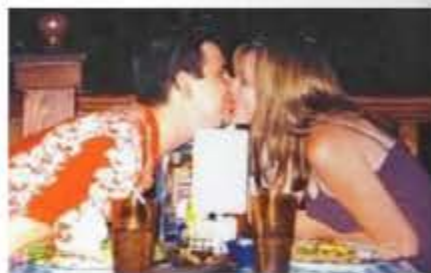
Celebrating on our honeymoon.