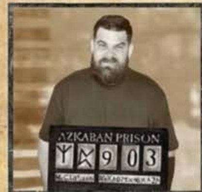
Wizarding World: We love Harry Potter!

Growing up, we had a cabin in a small mountain town and we'd go there almost every weekend to ride ATVs and snowmobiles, swim in the river, explore the woods, take the boat out on the lake, and go snowboarding. These experiences instilled in me the love of nature and the outdoors. A fond memory from this time is that one summer I sold a bunch of pine cones for $1 each in the neighborhood. However, I collected the money first with the intention to deliver the pine cones later, but couldn't remember who bought them.