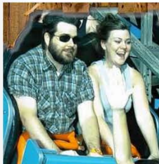
Silverwood in Coeur d'Alene, ID