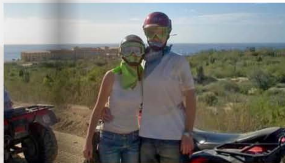
ATVing in Mexico