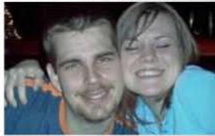
Mexican cruise our 2nd year of marriage.