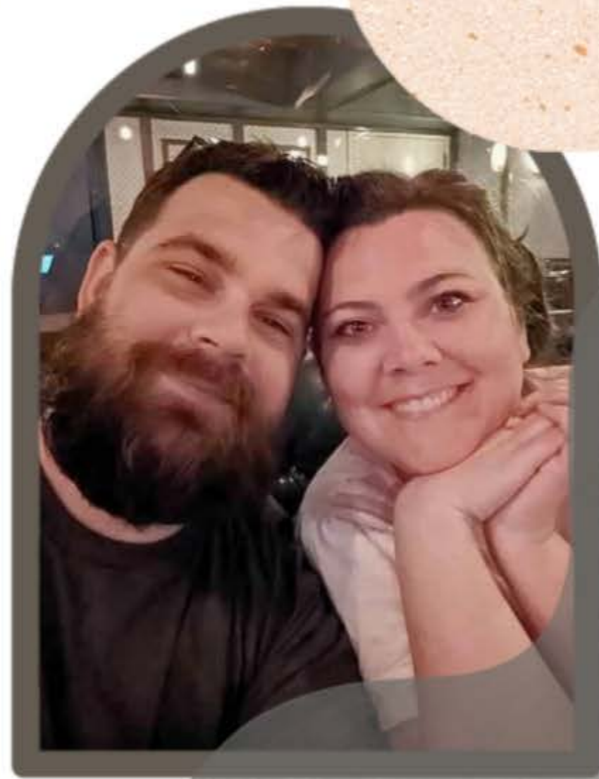
Dinner in NYC