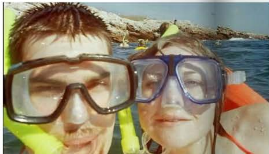
Snorkling in the Gulf of Mexico