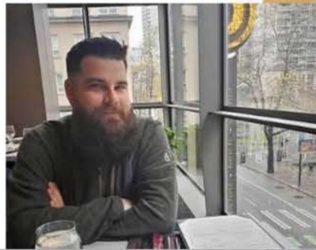
Brunch in Seattle