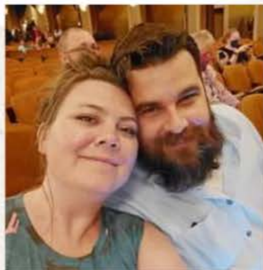
Seeing Hamilton in Seattle