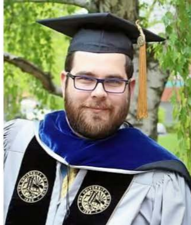
Getting my PhD