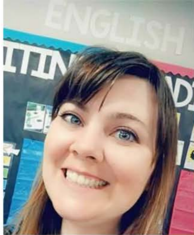
In my classroom