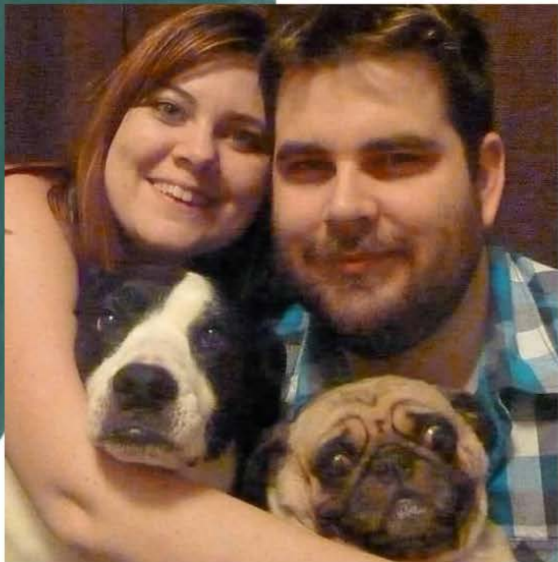
Our past dogs: Oreo and Gromit: We love dogs!