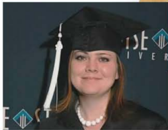
Getting my undergraduate degree