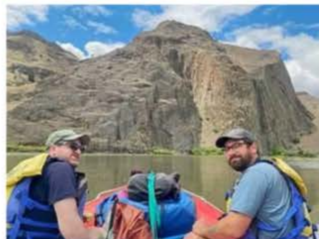
Rafting and camping the John Day River in Oregon