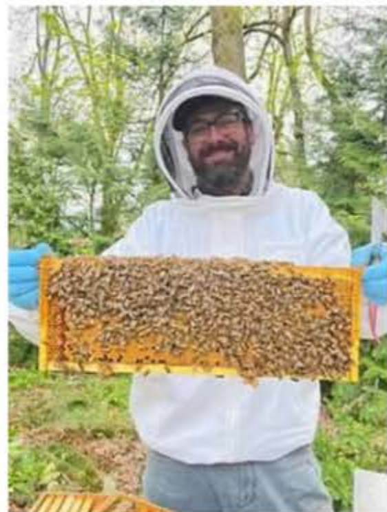
Checking on the backyard bees

Works as a teacher at an elementary school (currently a mixed class of 3rd & 4th graders)