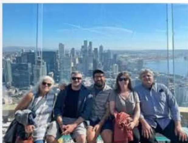
Space Needle with Drew's parents and Tom's sister