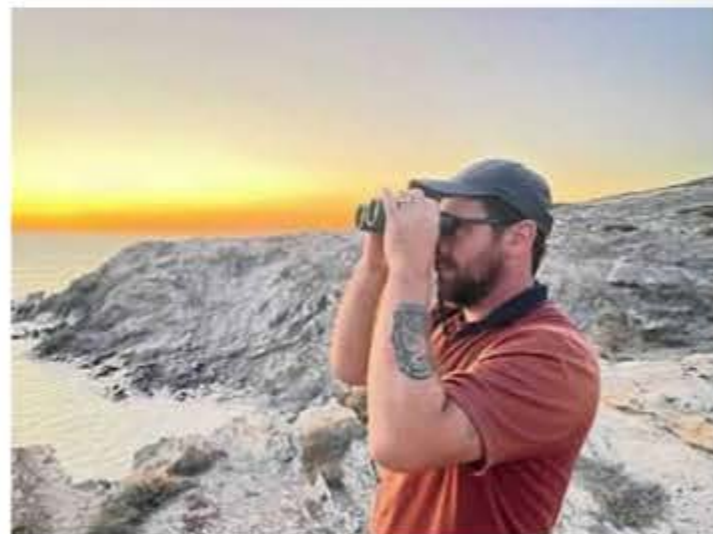
Birding on a trip to Italy

Loves spending time outdoors, finding and photographing wildlife, camping, learning about nature, playing cribbage, eating pizza