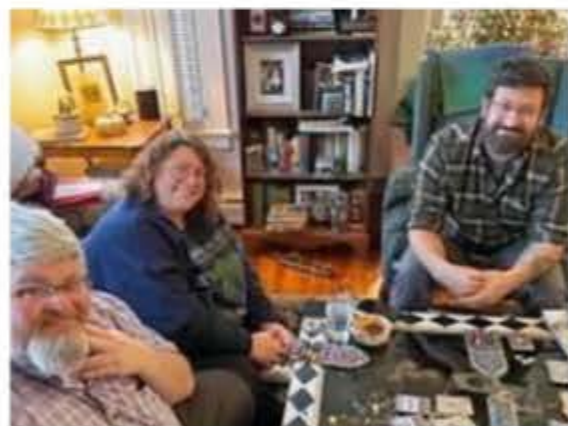
Boardgames with Drew's family