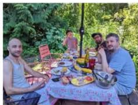
Friday night dinner with friends