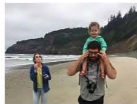
At the coast with friends