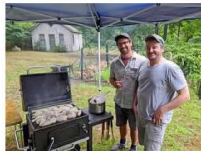
Summer cookout in Massachusetts