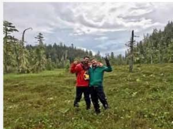
Bog walk in Alaska