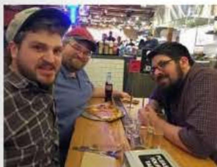
With my brothers, 2017

Growing up, I spent a lot of time with my good friends stomping around the woods, building forts and going on fake treasure hunts. We spent a ton of time at the beach throughout my childhood. I played soccer and spent a lot of time roller blading and playing street hockey.