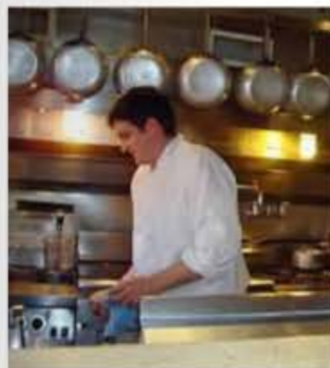
Line cook, 2008