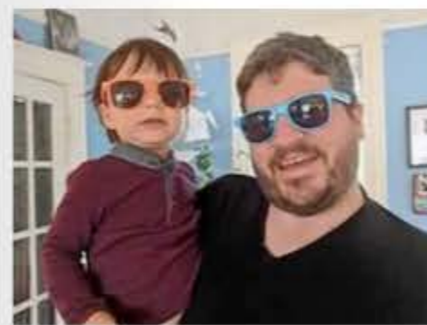
Drew with our best friends' kid

We were both extremely fortunate to be raised by generous, loving and open-minded parents and are lucky to have siblings we can count on and actually like hanging out with. We hope to be the kinds of parents that provide a child with opportunities to express themselves and learn about the world and how to make it better. We want our child to grow up knowing they have a lot of people who care about them and want them to be happy.