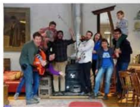
An annual reunion of old friends