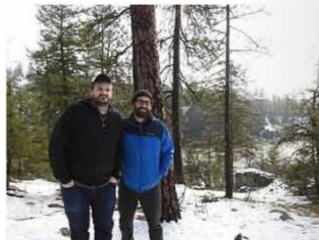
Winter walk in Spokane

We love to spend time with friends and family going on walks, playing games, cooking and telling stories. We've been fortunate enough to travel around the Pacific Northwest, around the country and on a few trips abroad. We are often camping with friends in the summer and finding new places to explore on the weekends and during school vacations.