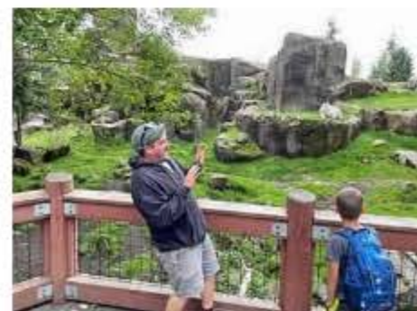
Reenacting mountain goat attack, 2022