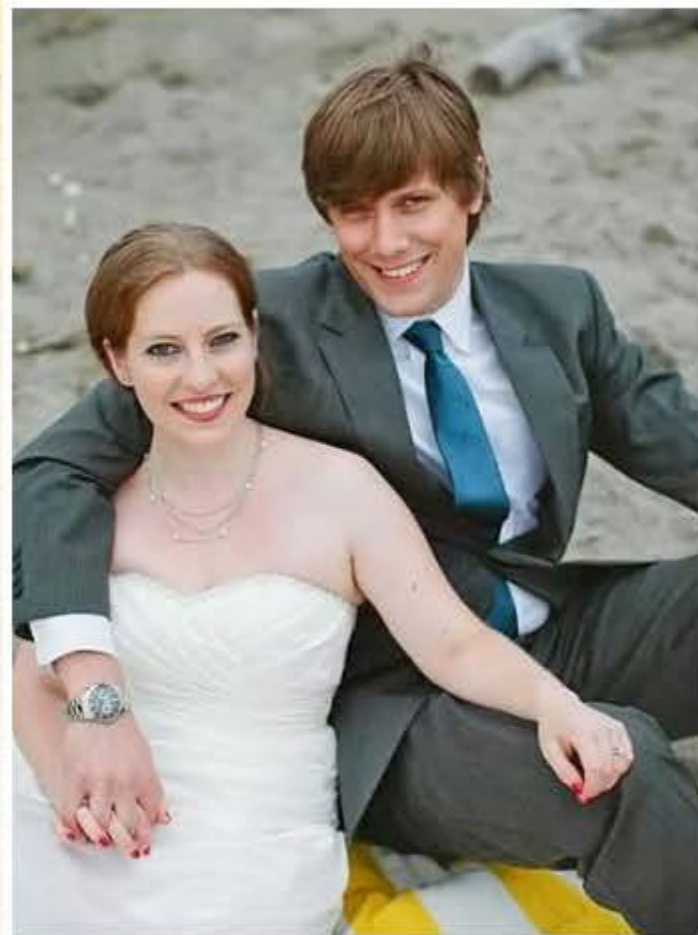
The pillars of our relationship are love, laughter, and friendship!