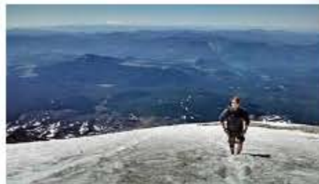
Mount St. Helen's

HOBBIES: Skiing, long distance cycling, video games