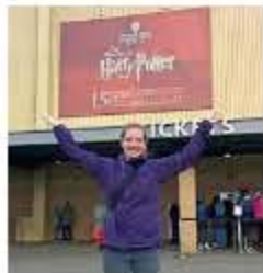
Harry Potter Studios, UK