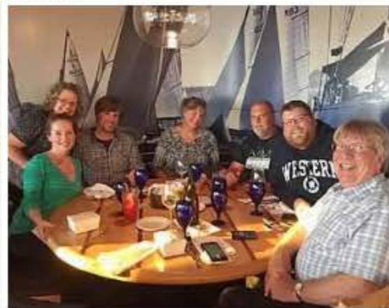
Father's Day with both sides