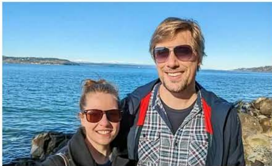
State park beach near our house

We believe in equity and inclusion and will raise our child to accept all people, no matter their race, culture, religion, gender, or sexuality. We will inform them about the systematic racism in our society and look forward to raising our child in our culturally diverse neighborhood where they can socialize and interact with other children that look like them.