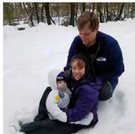
Snow fun with our nephew