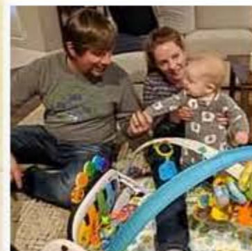
Playing with our friends' son

We believe in raising our child in an environment where they feel unconditionally loved, supported, and listened to. It is important to us that our child always feels safe and comfortable to come to us whenever they want to talk about something. Our child will have a support network of friends and family all along the way!