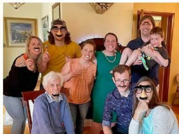
Cousin silliness with great aunt

Our family is everything to us and not a day goes by that we don't call, text, or video chat with each other, especially those that live a little farther away. We visit each other as much as we can, especially for holidays and special occasions. Regardless of which side we celebrate with, we spend the holidays baking cookies, listening to holiday music, playing games, and watching holiday movies.