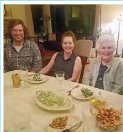
St. Patrick's Day