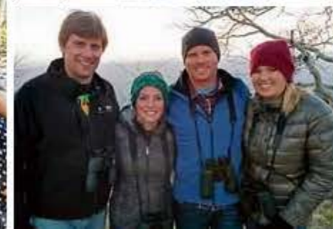
Photos: German friends visiting (top); Visiting German friends (bottom left); Ski crew (top bottom right); Arizona friends (lower bottom right)