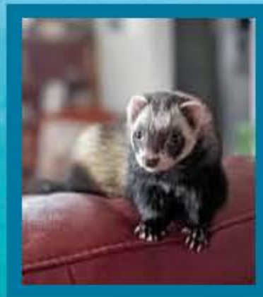
Sweasel got her name because she is a sweet weasel