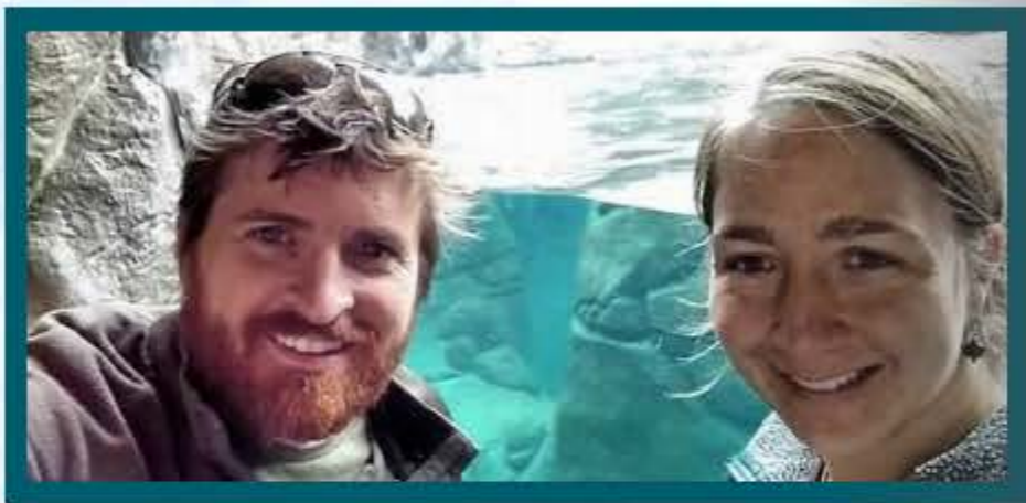
Our first camping trip

For our first date in May of 2015, we meet at a local brew pub after finding each other online.