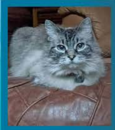
Mira is the sweetest old lady cat and loves her patio