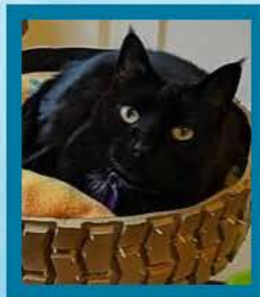
Toothless is a drooler and loves attention!