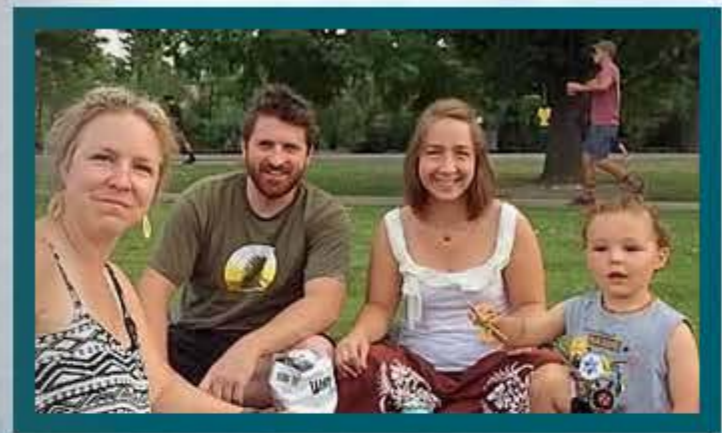
First 4th of July with the family

Because we are both introverts, we knew it wasn't likely we were going to meet "our person" in a conventional way.