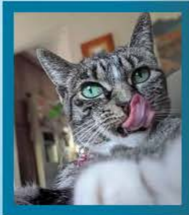
Zenia loves lounging on the couch in front of the fire