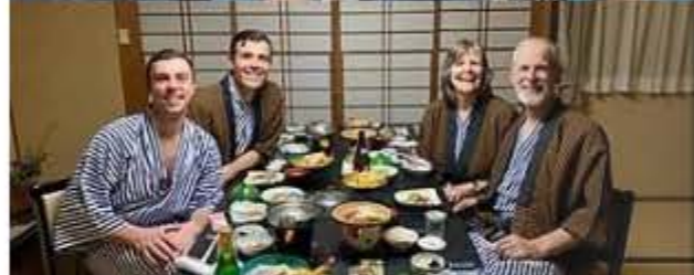
Japan adventures with Davis' parents and time at the zoo with cousins!