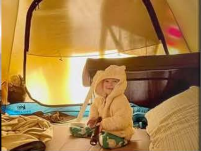
First time camping with this kiddo, and guess who woke up bright and early!