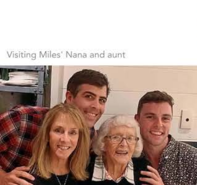
Visiting Miles' Nana and aunt