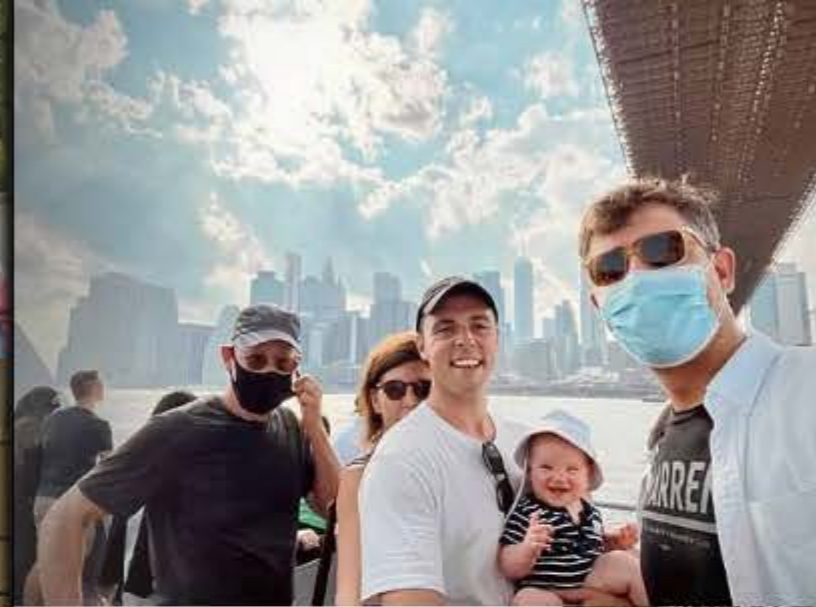
Summertime ferry ride in NYC!