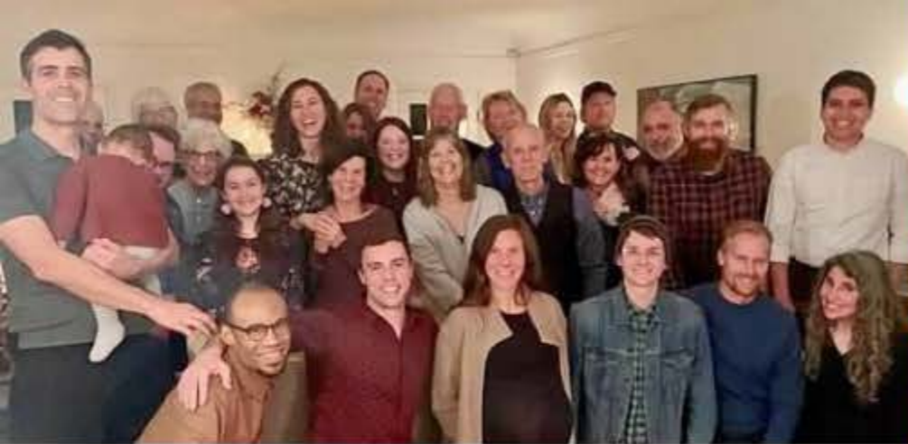
Hosting Thanksgiving . . . for 30 people!