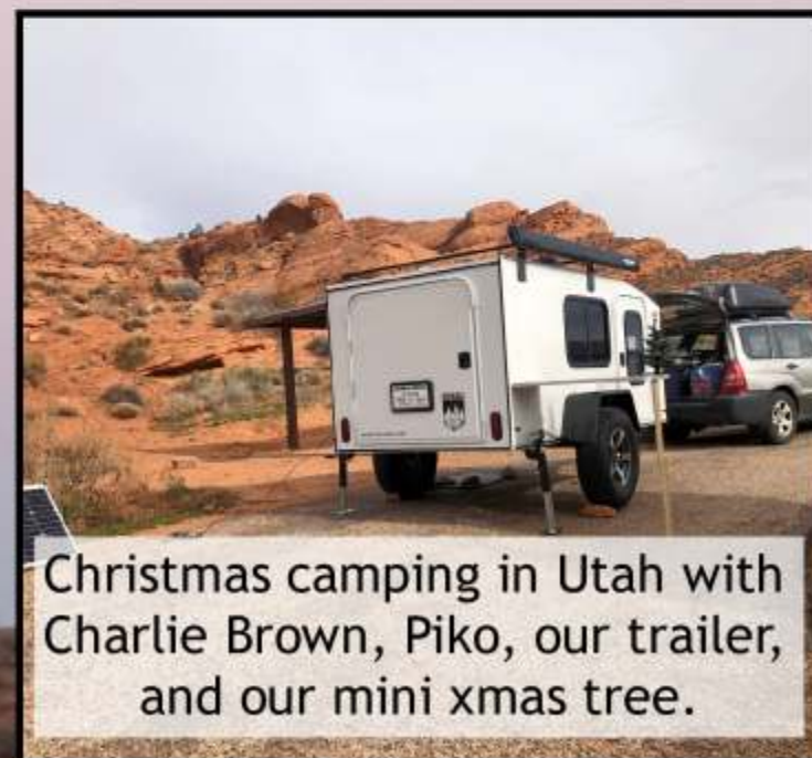
Christmas camping in Utah with Charlie Brown, Piko, our trailer, and our mini xmas tree.