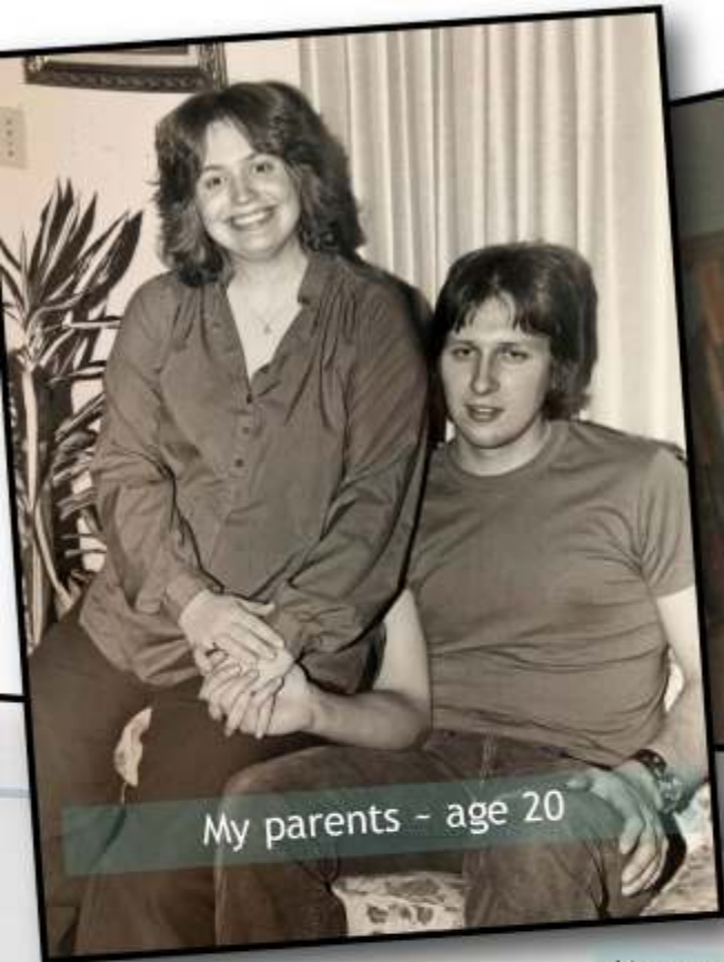
My parents - age 20