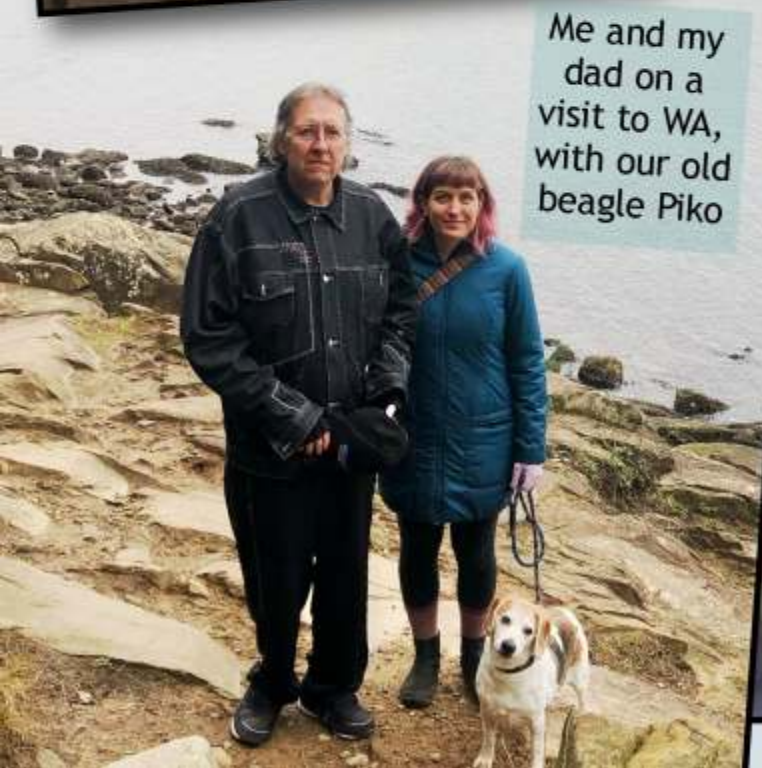
Me and my dad on a visit to WA, with our old beagle Piko