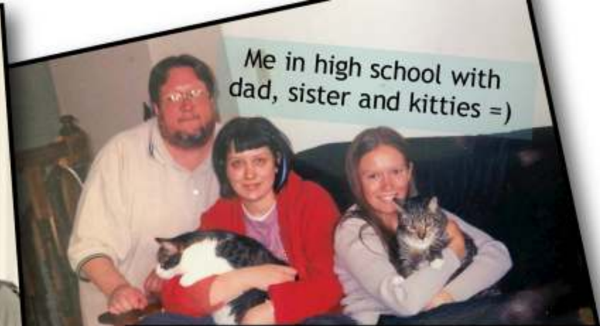
Me in high school with dad, sister and kitties =)