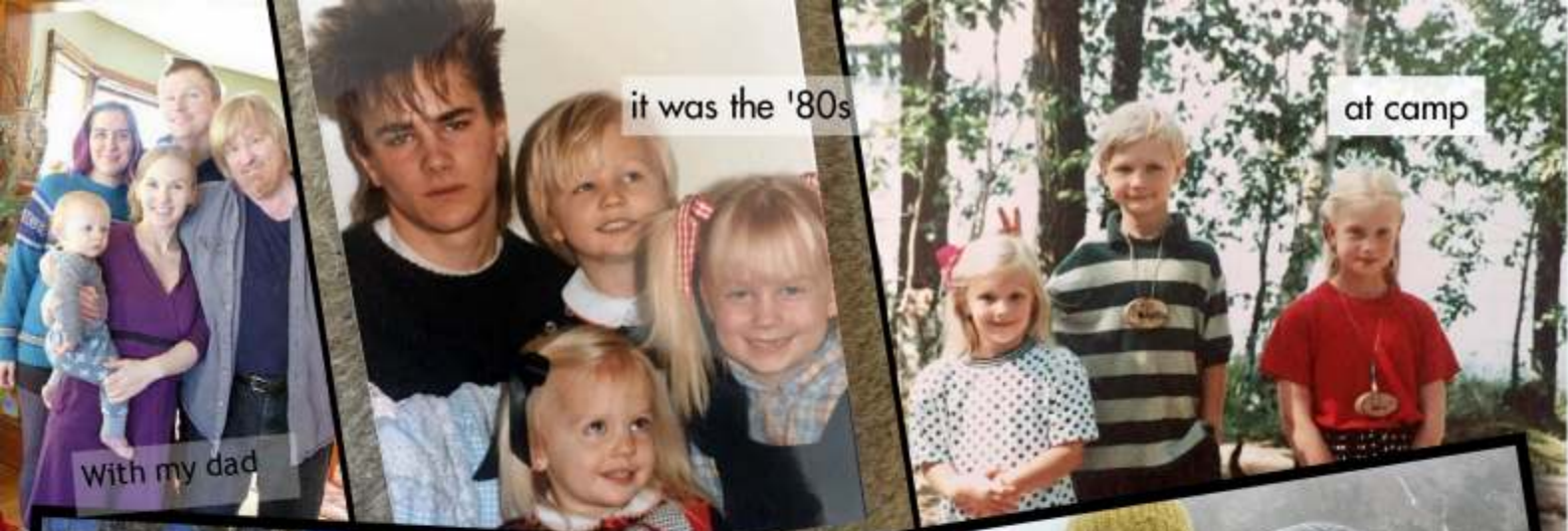
With my dad