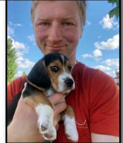
These are pictures of Sisu, who joined our family in July 2021