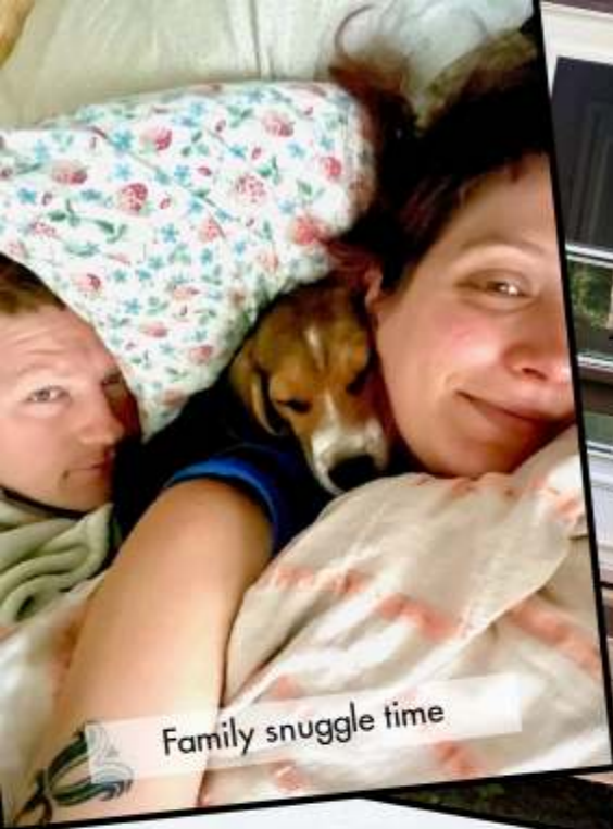
Family snuggle time