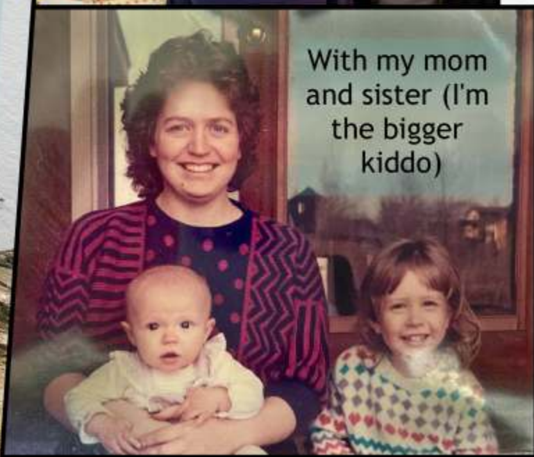
With my mom and sister (I'm the bigger kiddo)

I grew up in a suburb of St. Paul, MN. My parents both struggled with substance abuse and mental health issues, which made growing up sometimes bumpy. In spite of this, there was a lot of love in our house, too. My mom was a terrific cook, had a magic green thumb with plants, and had a soft spot for all animals (wonder where I got it from!). My dad loved science fiction, collecting watches, and was always there for a friend in need. My mom died very young at the age of 40 (when I was 18). I got another 20 years with my dad and we talked on the phone nearly every day. He died in an accident in 2020. I miss them both every day.