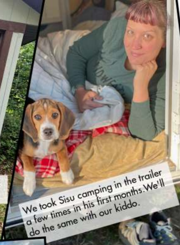
We took Sisu camping in the trailer a few times in his first months. We'll do the same with our kiddo.