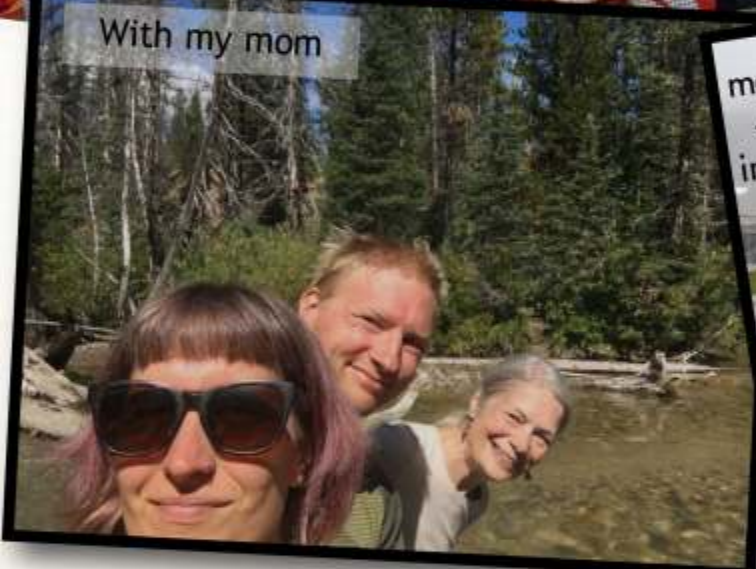
With my mom