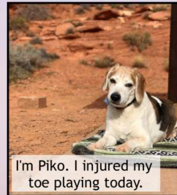
I'm Piko. I injured my toe playing today.