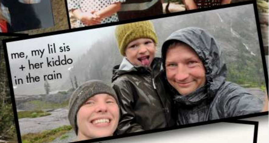
me, my lil sis + her kiddo in the rain