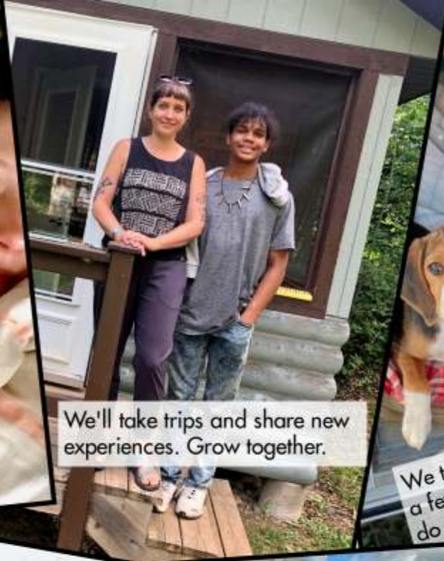
We'll take trips and share new experiences. Grow together.