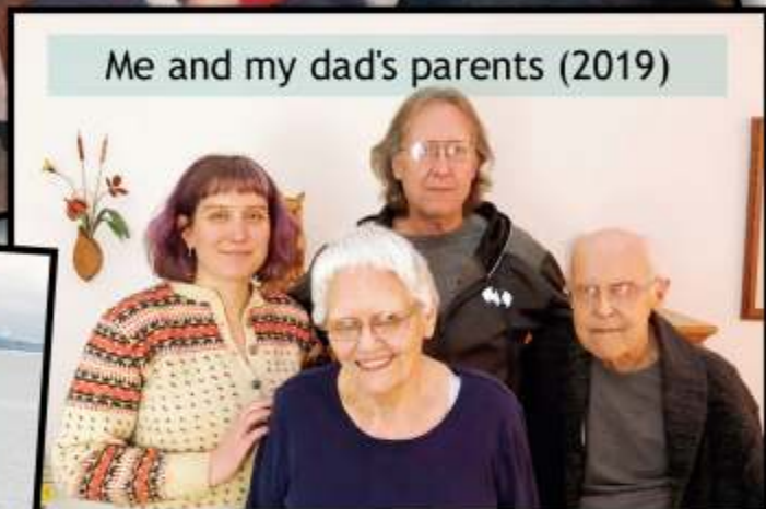
Me and my dad's parents (2019)