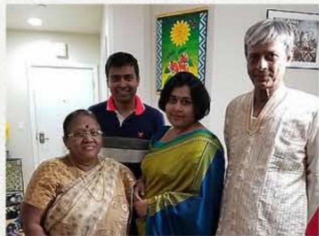
With Sumana's parents