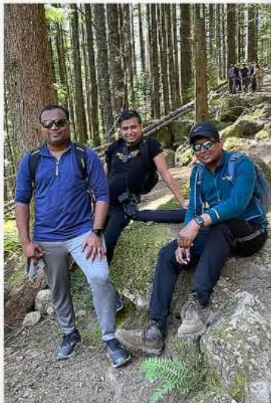
Resting point in a hike