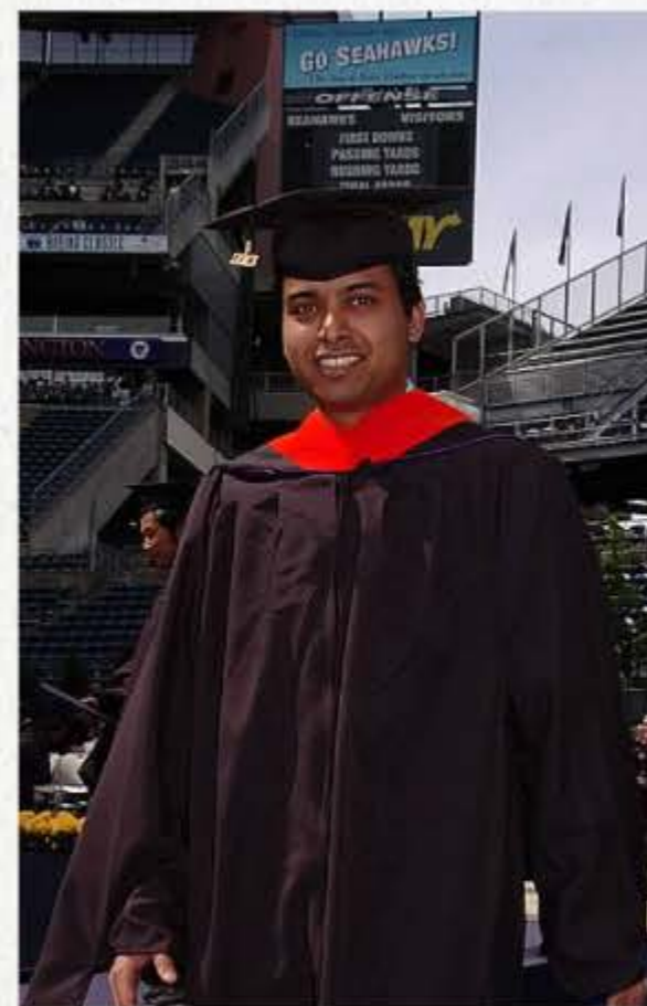
Graduation ceremony at UW

During my time in school I became interested in computers, and started learning programming in 8th grade. After high school I got the chance to study in Computer Science. I finished my Bachelor's in Computer Science in 2001 and joined an IT firm in India. After a few years of working there I got an opportunity to work in the U.S., and moved here in 2005. I was able to complete my Master's Degree in Electrical Engineering from the University of Washington which has helped me a lot in my career.