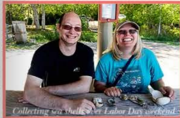
Collecting sea shells over Labor Day weekend

Communication with the birth family could take place in a variety of manners including the exchange of pictures and letters, phone calls, or face-to-face contact. Zoom is also great! We are willing to occasionally drive to them or find a halfway point to meet if they are not local. We look forward to extending invitations to the birthparents to meet for our child's school and extra-curricular events. Also extending invitations to join us at the local holiday lighting festivities and parade and outdoor movies in the park and parade in the summer. Also birthdays and other milestones.