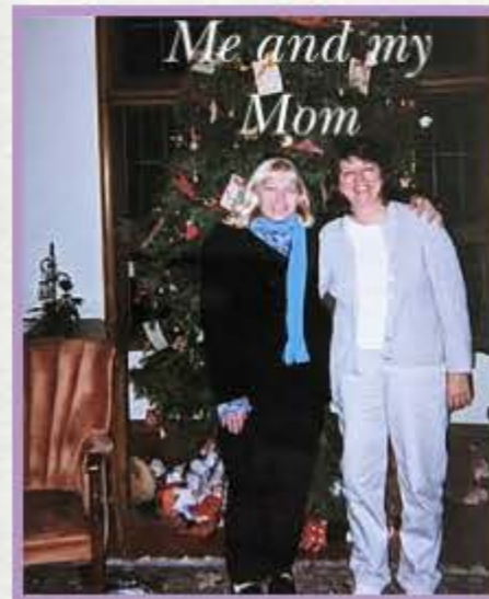
Me and my Mom