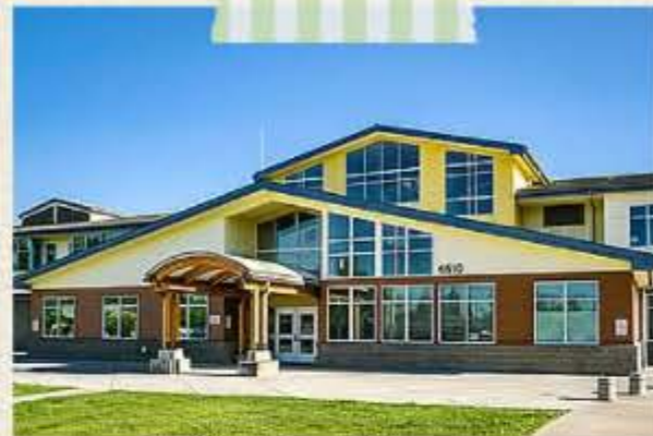
Our local library.