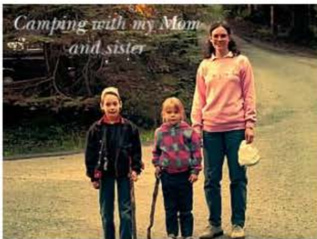
Camping with my Mom and sister