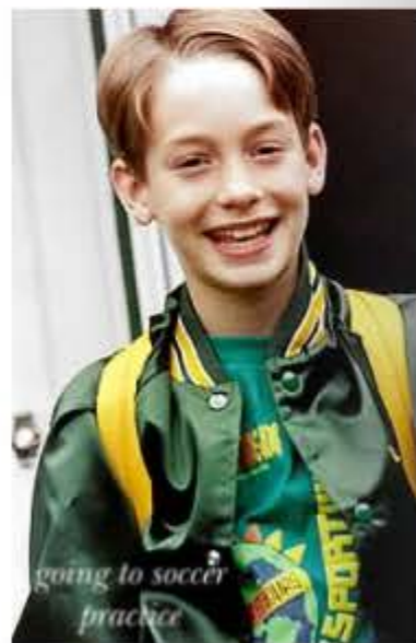
going to soccer practice