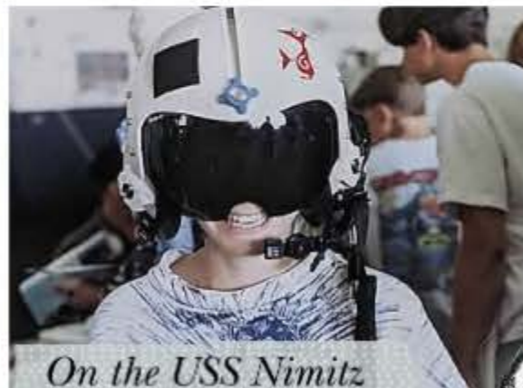
On the USS Nimitz