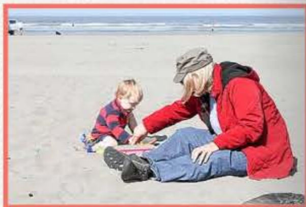
our nephew and niece

We are aware that a child will understand adoption differently at various developmental stages, requiring continued and developing conversation throughout the child's life. We hope to help the child understand our home is a safe place for them to process adoption issues, concerns, and questions. We both already enjoy family-friendly activities-such as board games, card games, going to the movies, perusing the local library, and spending time at the local parks-and they cannot wait to invite children into these past times.