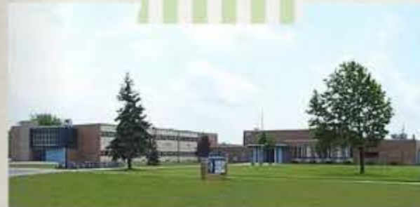
Local school in our community.