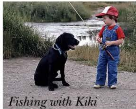
Fishing with Kiki