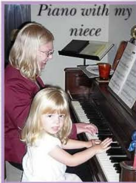
Piano with my niece