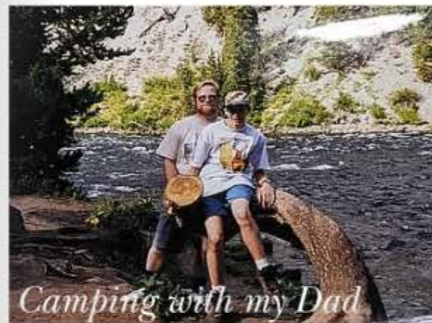
Camping with my Dad