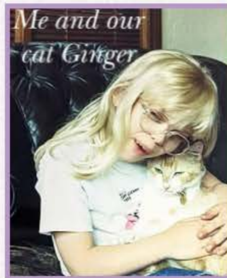
Me and our cat Ginger