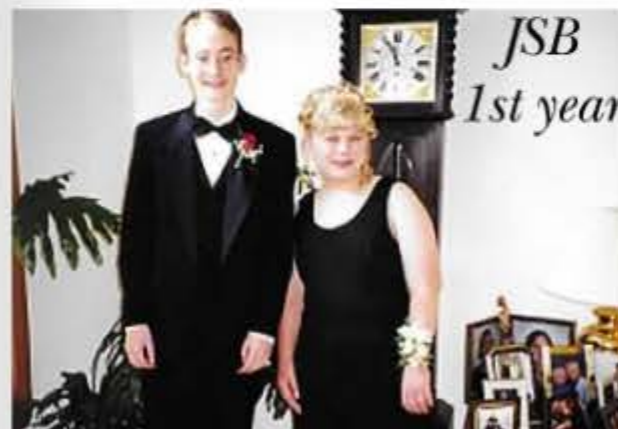
JSB 1st year