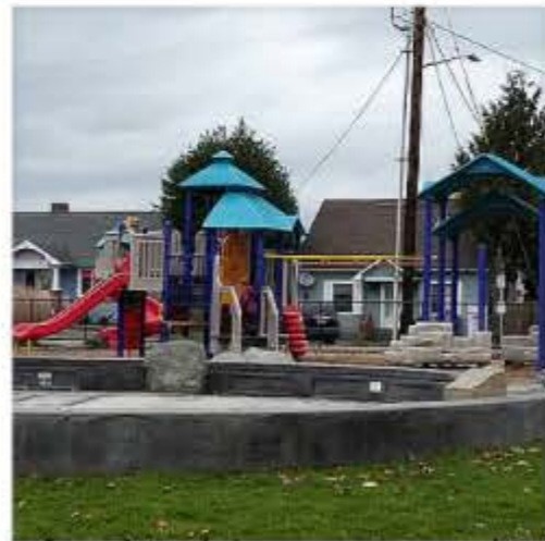
Local park in our community.