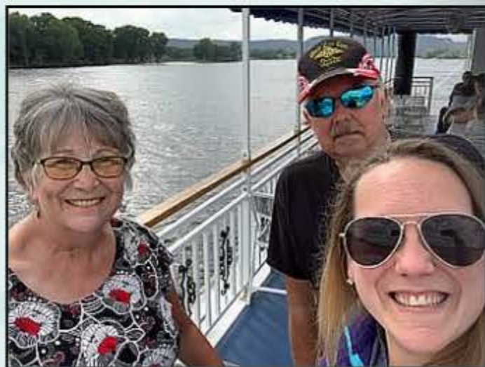
My mom, dad, and I on the LaCrosse River Boat.