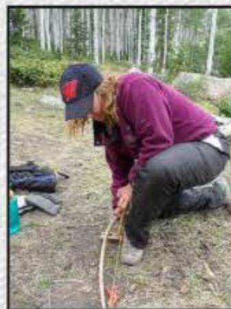
While working in Utah, I learned how to make a fire using a bow drill.