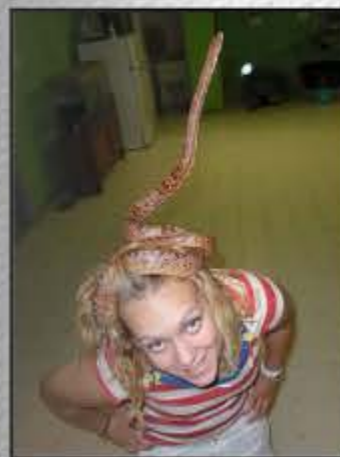
In Tennessee, I taught kids Environmental Education.