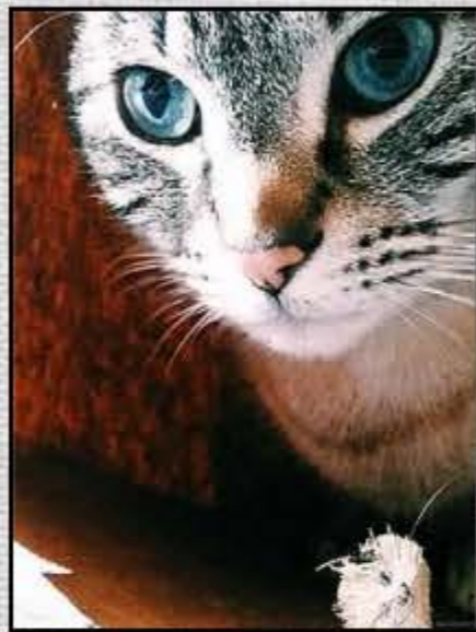
SAHALE BORN IN 2007

Likes: Paper bags, licking butter off of popcorn, Kelly