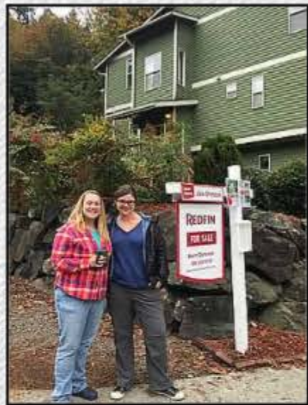
Our forever home

We looked for a house for a year. When we saw our house we knew it was meant to be. We enjoy filling our house with friends and family, friends for dinner, game nights, sleepovers, music, and love.