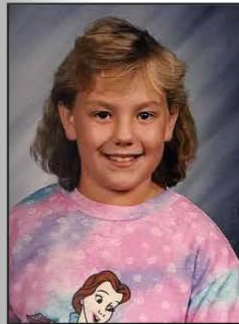
Age 8: Loved Disney's Beauty and the Beast