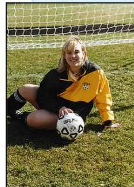
Age 15: Varsity Soccer

Growing up, my parents supported activities I was interested in. My father and I joined Tae Kwon Do together. I have a black belt. My mother and I started to attend a UCC church. They enrolled me in yearly soccer programs. They allowed me to gain my independence by going to summer camps of my choice (band camp and church camp). They listened to hours of me playing the trombone. All of this with patience and grace.