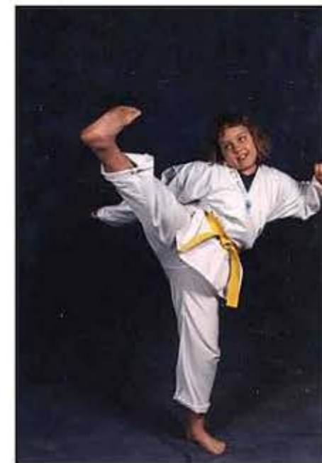
Age 10: TaeKwonDo