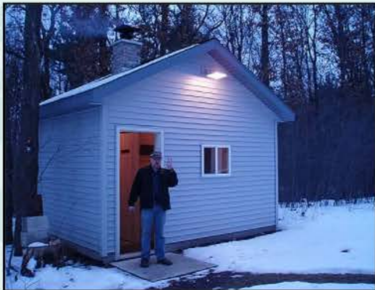
My father in front of the sauna.

Some of my favorite memories of my childhood were taking road trips during the summer. The place we visited most often was Mackinac Island in Michigan.