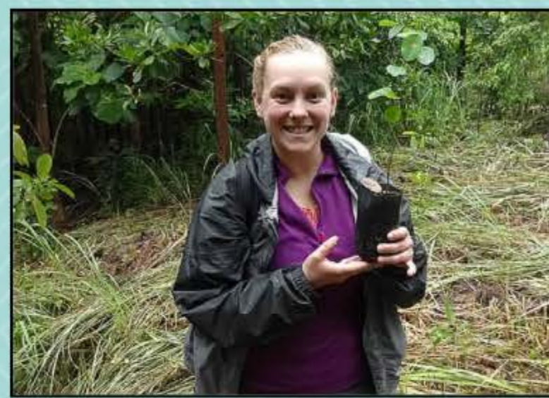
Selena in Thailand, 2014