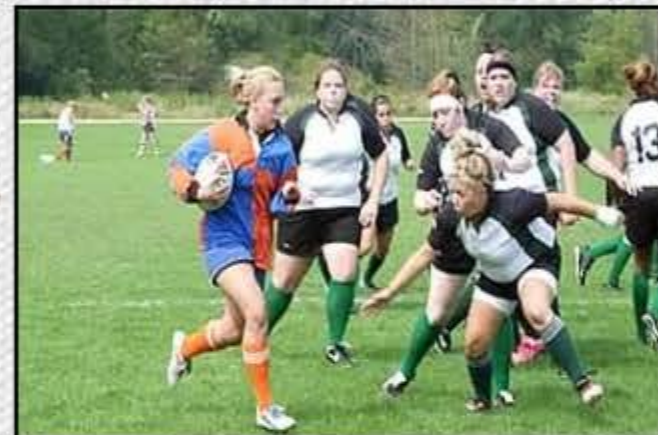
One of my favorite memories in Rugby: the first time I scored a try.

After graduating high school, I went to the University of Wisconsin-Platteville to study Elementary Education and German. While I was in college, my brother died in a car accident. This was one of the hardest events in my life. He was my best friend. Through the support of family and friends, I began to heal. One of the best decisions I did at that time was join Rugby. Rugby allowed me to channel my energy through the sport and introduced me to a supportive friend community. After college, I lived in Tennessee working as an environmental educator. Then I moved to Utah to work in Wilderness Therapy. Finally, I found my home in Seattle.