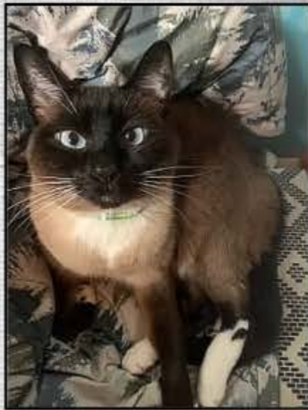
POSEY BORN IN 2012

Likes: Sleeping in front of the fireplace, exploring