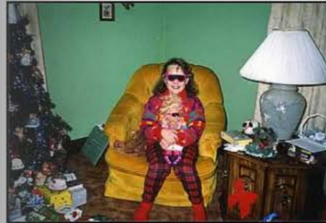
Age 9: All I wanted for Christmas was this rollerblading doll. When I got her and we had matching shades, it was officially the best Christmas. (This is still one of my favorite pictures.)