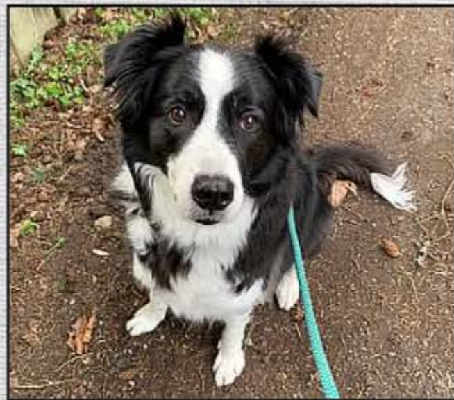
KONA BORN IN 2008

Likes: Food, squeaker toys, greeting people on walks