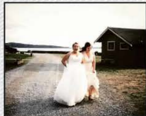
Camp Kelena 2017