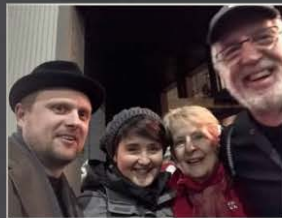
Clockwise from top left: with Garret's dad & stepmom; group photo with family; dad giving a toast at our wedding reception; Husky basketball game with dad; stepbrother's wedding - where Garret was the photographer.