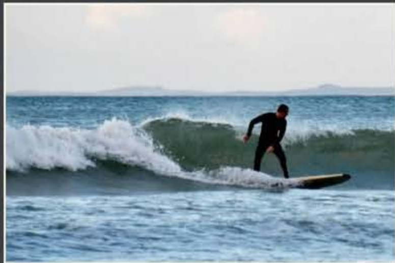
This page top: surfing in New Zealand; below L->R: photographing clouds; aviation interest started young; out for a sail on a friend's boat.