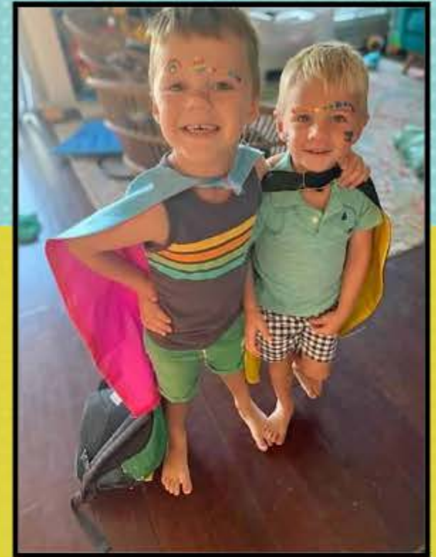
Upper left: camping smiles Upper right: dress-up box Lower left: Spring Break in Florida! Lower right: annual NC beach trip