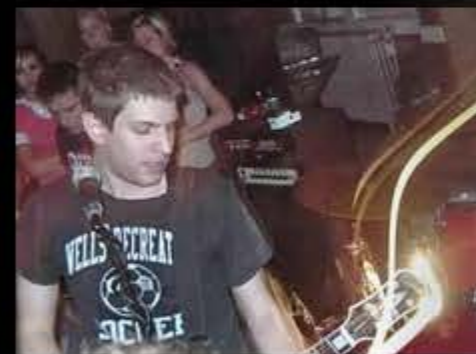
COUNTERCLOCKWISE FROM TOP LEFT: Recording some drums; one of my old bands playing a house show; same band playing a grunge hall, another early band playing at some unidentified community center in Southern Maine