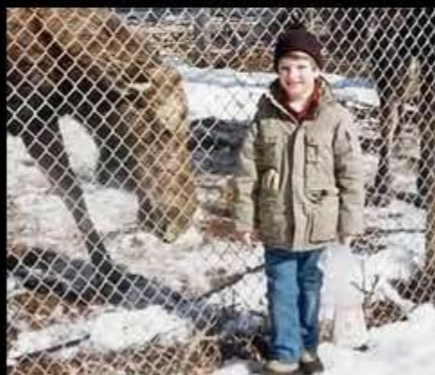
Making friends in southern Maine