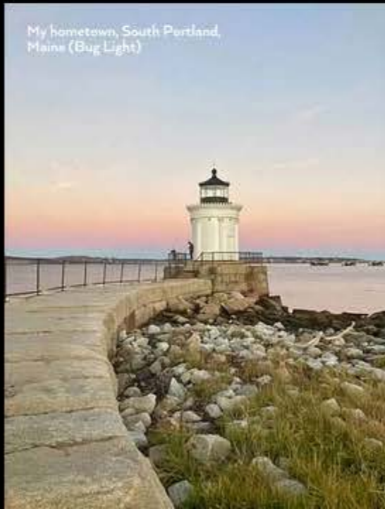
My hometown, South Portland, Maine (Bug Light)

I grew up in a coastal suburban town in southern Maine. I had a pretty idyllic childhood in a neighborhood full of kids my age, playing outside until we were forced to go in for the night.