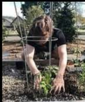
Watching the Pickles

We like being close to public transit and in a walkable and bikeable area. In the summers, we like to go to Portland Pickles games and our farmer's market.