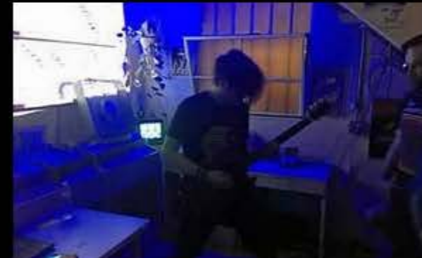
LEFT AND ABOVE: Performing my solo chiptune project at Ground Control and Final Form, respectively