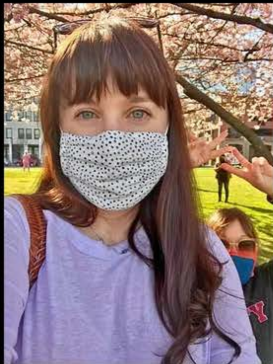
Cherry blossoms in the early pandemic days