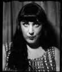
Trial makeup preserved for all time