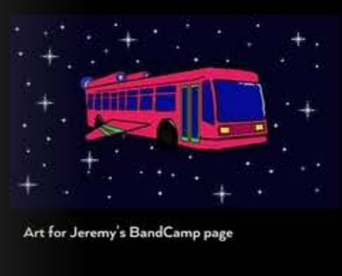
Art for Jeremy's BandCamp page