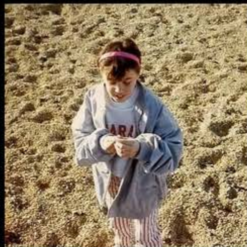
RIGHT: Collecting seashells in Ireland

I spent a lot of my summers up at the lake. My great uncle purchased a cabin about 45 minutes west of Portland, Maine in the 1930s. Three generations of our family spent time there every year. In 2007, my parents inherited the property and built a year-round house in which to retire. I go back every summer to swim, kayak, and see friends and family.