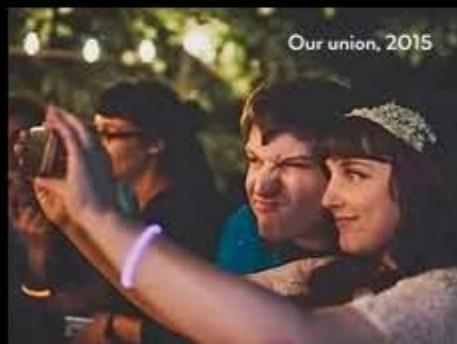
Our union, 2015