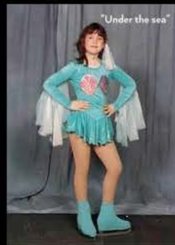
I am a decent ice skater and a better roller skater.