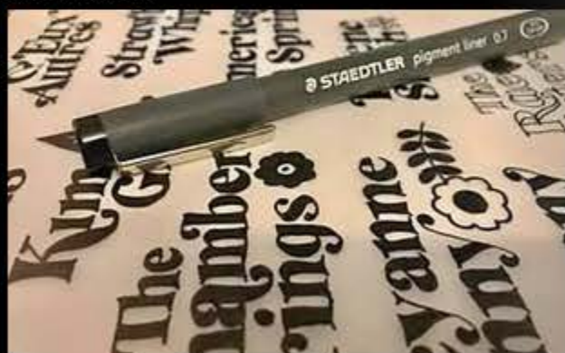
Behind the scenes

Jeremy is a life-long amateur cartoonist, occasionally dabbling in collage and pixel art.