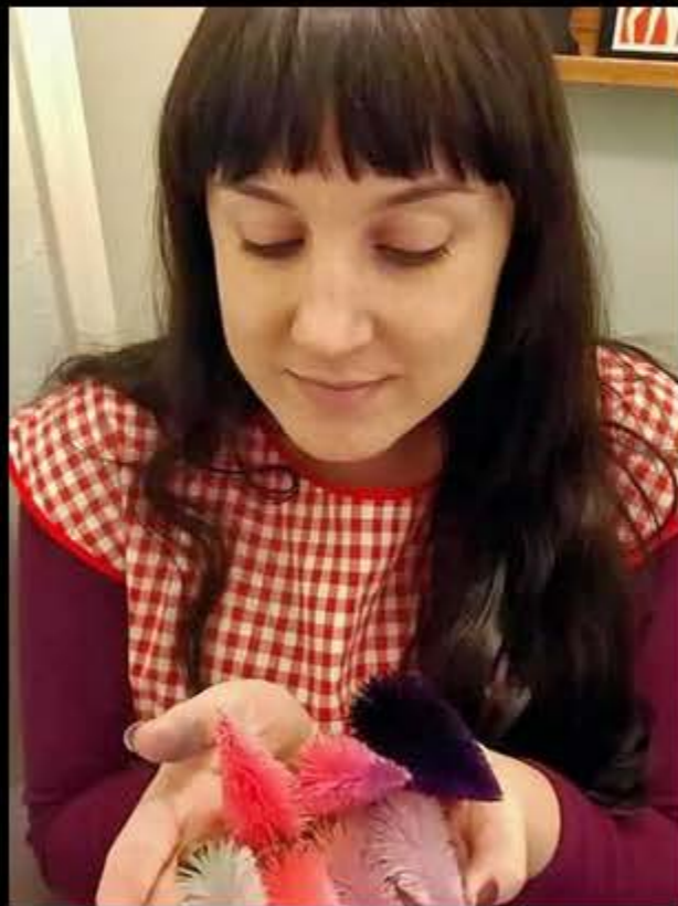
Hand dyeing bottle brush trees

I love holidays but particularly Christmas and I've made an annual curated deep-cuts Christmas Mix for the last 15 years.