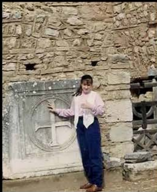
Exploring ruins in Greece (my maternal family side)

My family traveled quite a lot through my childhood. My father is a first-generation American whose parents came over from Ireland just before he was born. We reconnected with his family in the Galway area and went back just about every other year. I have wonderful memories playing with my cousins and exploring the country. I have been back a few times and hope to continue this tradition.