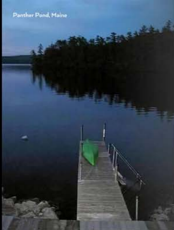
Panther Pond, Maine

I spent a lot of my summers up at the lake. My great uncle purchased a cabin about 45 minutes west of Portland, Maine in the 1930s. Three generations of our family spent time there every year. In 2007, my parents inherited the property and built a year-round house in which to retire. I go back every summer to swim, kayak, and see friends and family.