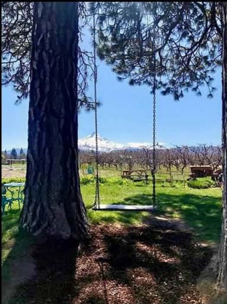
On the Hood River fruit loop