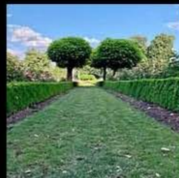
Peninsula Rose Garden

I moved to Portland two decades ago on a whim and love exploring new places, walks and light hikes, the many historic movie theaters (and the 99W drive-in), and all the great vegan food.