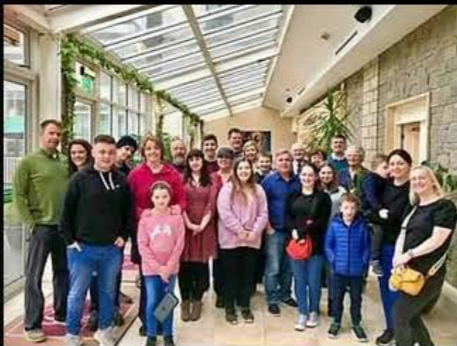
BELOW: My Irish and American family in Ireland

My family traveled quite a lot through my childhood. My father is a first-generation American whose parents came over from Ireland just before he was born. We reconnected with his family in the Galway area and went back just about every other year. I have wonderful memories playing with my cousins and exploring the country. I have been back a few times and hope to continue this tradition.