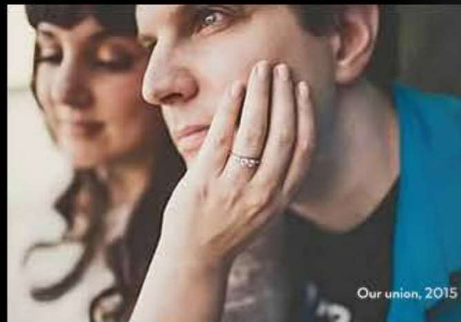
Our union, 2015