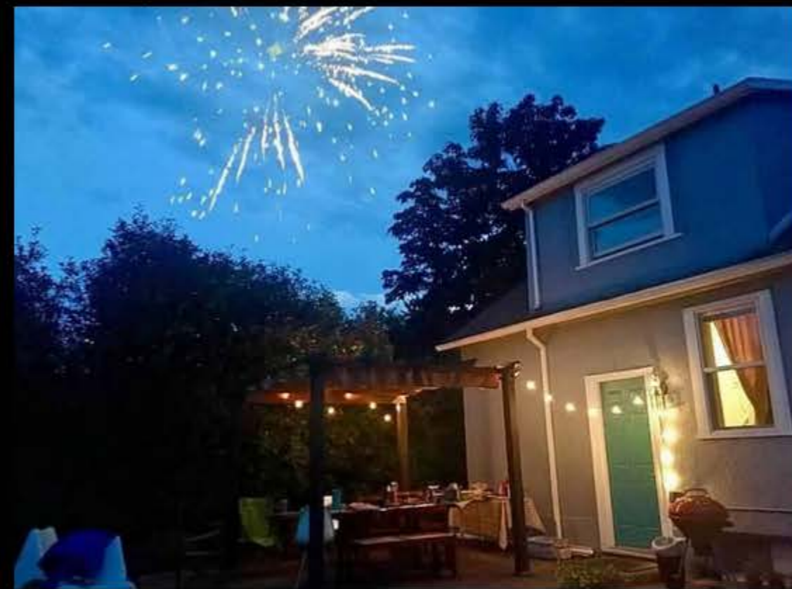
Our 1925 house and yard