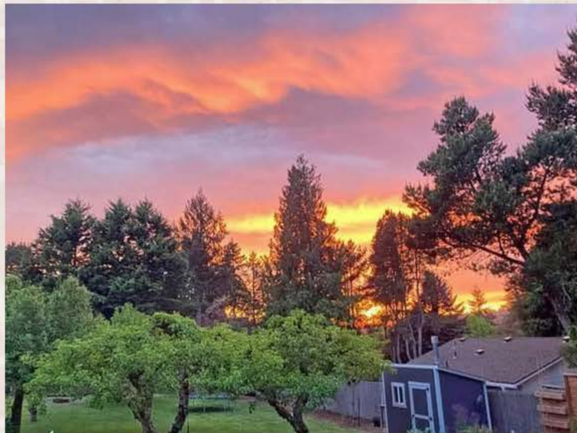
Our home, our happy place

We live in Southwest Portland, close to tons of parks, trails, the Southwest Community Center at Gabriel Park, and the Multnomah Art Center, all of which we visit pretty regularly. It took us a few years to fix up our house and get the yard in shape, but now it's our favorite place to be! We spend as much time as we can out in the yard playing, jumping on the trampoline, chilling on the hammock, and tending to the apple trees and the garden. Inside, we've got a few good spots for making forts!