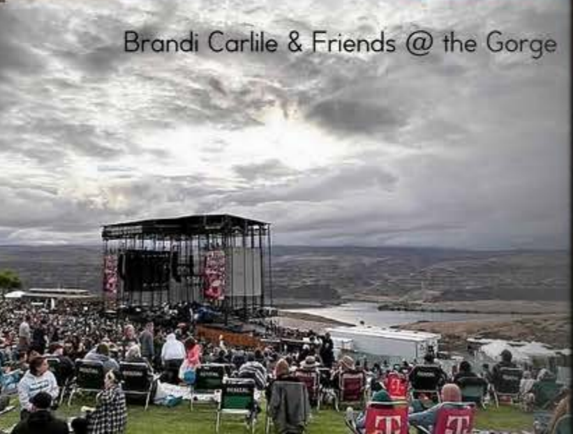
Brandi Carlile & Friends @ the Gorge