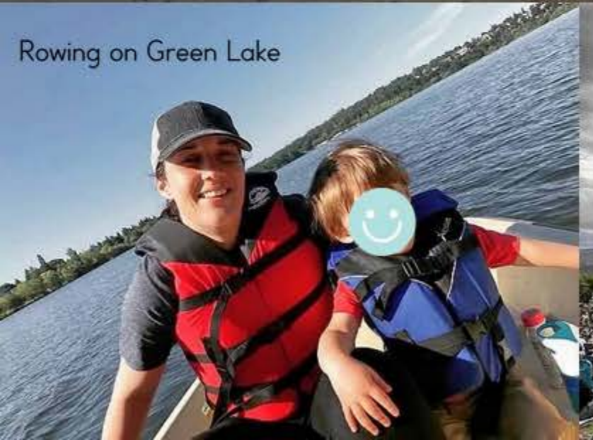
Rowing on Green Lake