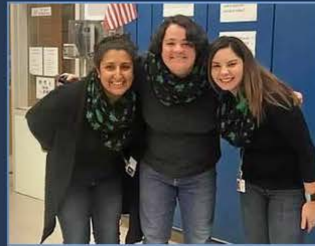
Matching outfits with my teacher besties at school.