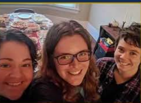
We love hosting our annual "Friendsgiving" with all the best side dishes.