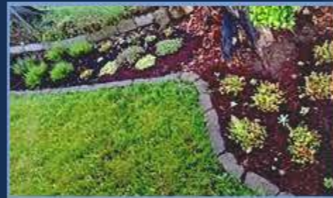
I love caring for my indoor and outdoor gardens.