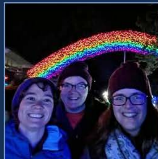
My college friends made the Northwest feel like home.