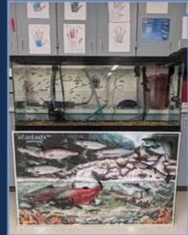
I help raise salmon at my school and take students to a local creek to release them into the wild.