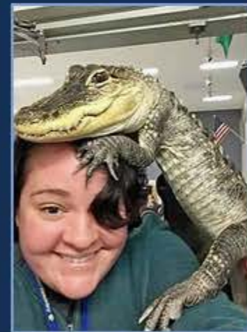
I love that I get to be silly at my job. This is from when the "Reptile Man" came to my school.

After high school I decided to leave California and go away to college in Washington. I got a degree in history and then was accepted into the Teach for America program, where I got my Masters in Teaching and started teaching in Las Vegas. I enjoyed my time in Las Vegas, but the Northwest was my true home. I have been teaching 4th grade here in Washington for the past 8 years. Being a teacher is a huge part of my identity. I care deeply about my school community and investing in the lives of students. I am looking forward to having a child of my own to share my love of learning and to prepare them for their future.