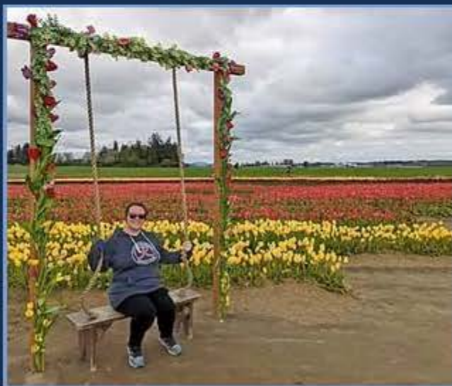
Enjoying the Skagit Valley Tulip festival, a fun tradition we do every few years.