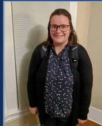
My first day of student teaching.