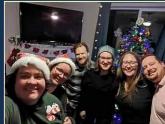
Our Tacoma crew takes turns hosting each other every month for dinner and board games.