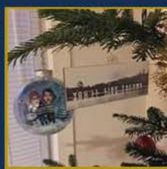
Every year we exchange home made ornaments.