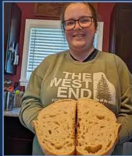
I love baking fresh sourdough bread and treats.