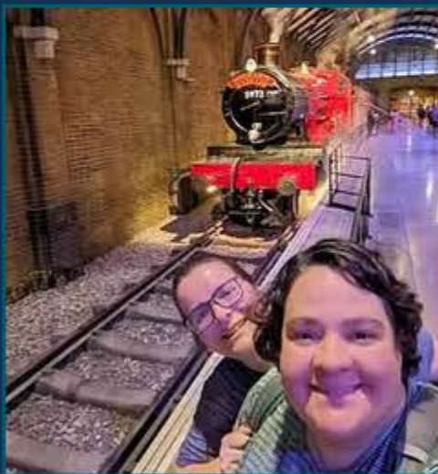
Seeing the Harry Potter studios in London.