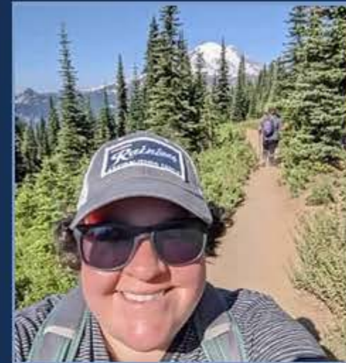
Seeing the beauty of Washington's National Parks, Mt. Rainier and Olympic.