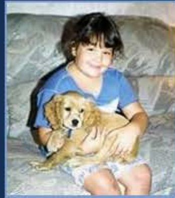
My love of dogs began with my childhood pup, Sandy.

I grew up in a suburb of Los Angeles with my mom, dad, and older brother. Both my parents were educators; my mom taught elementary school and my dad was a principal. They instilled in me the importance of education and inspired me to become a teacher. My family is very tight knit. Growing up we spent quality time together playing games and going on trips, and would see extended family often. My grandparents lived nearby and introduced me to my hobbies of crafting and gardening. I grew up playing lots of sports, but basketball was my passion. My family has always been supportive of me and my endeavors, giving me the confidence to succeed.