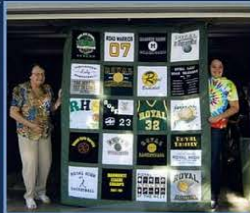
My first quilt, made with help from my grandma, using my high school basketball t-shirts.