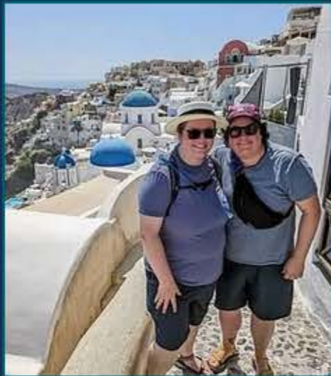
Visiting the island of Santorini, Greece.