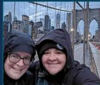
Walking across the Brooklyn Bridge in NYC.