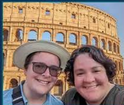
Our teacher schedules have given us the opportunity to travel. We appreciate experiencing different places and cultures to learn more about the world.