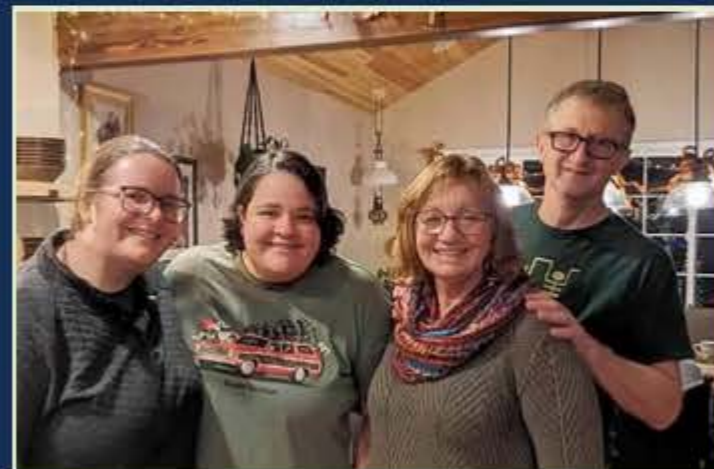
We are very close with Rose's aunt and uncle who live close to us.