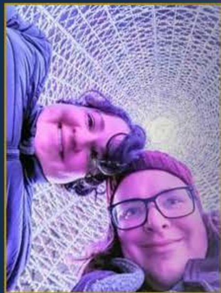
We find different holiday events each year. Christmas light displays are our favorite.