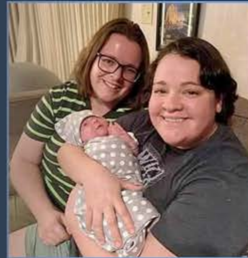
Getting to hold my nephew when he was 1 day old.