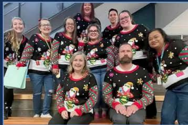
Matching ugly sweaters with the 6th grade team at my middle school.