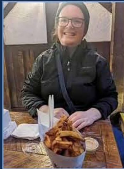
I enjoy hunting for my next great potato experience.