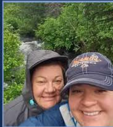
I love spending quality time with my mom hiking.