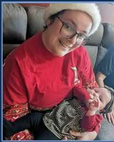
Meeting our brand new niece.