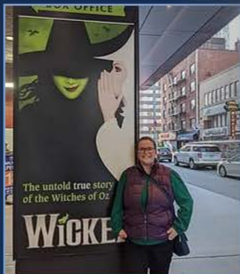
I love musicals. We were lucky enough to see Wicked on Broadway.