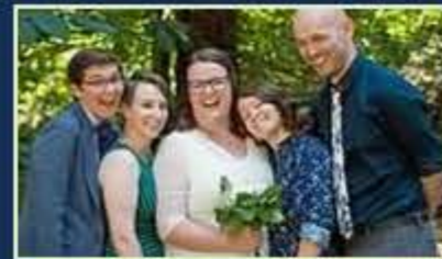
Having fun with our friends on our wedding day.