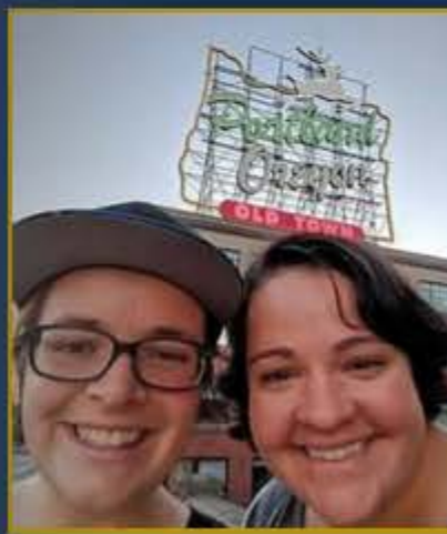
We go on annual trips to Portland and the San Juan Islands.