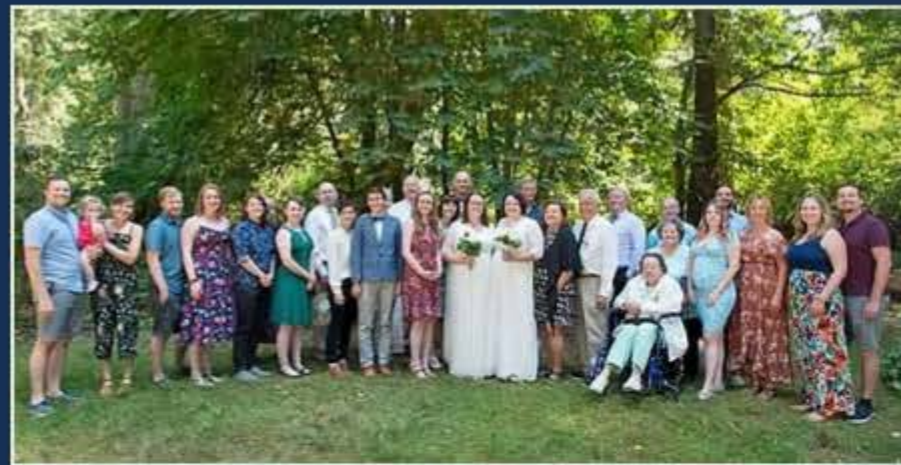
All our closest friends and family gathered for our Wedding at Point Defiance Park in summer 2019.