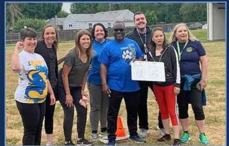
Victory picture after defeating our students at the annual staff vs. 5th grade kickball game.