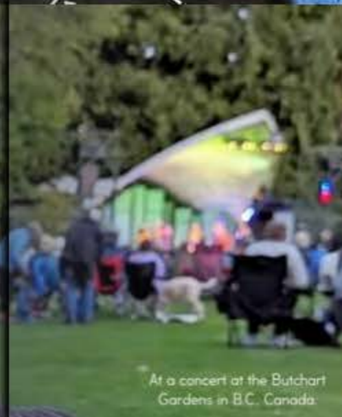
At a concert at the Butchart Gardens in B.C. Canada.