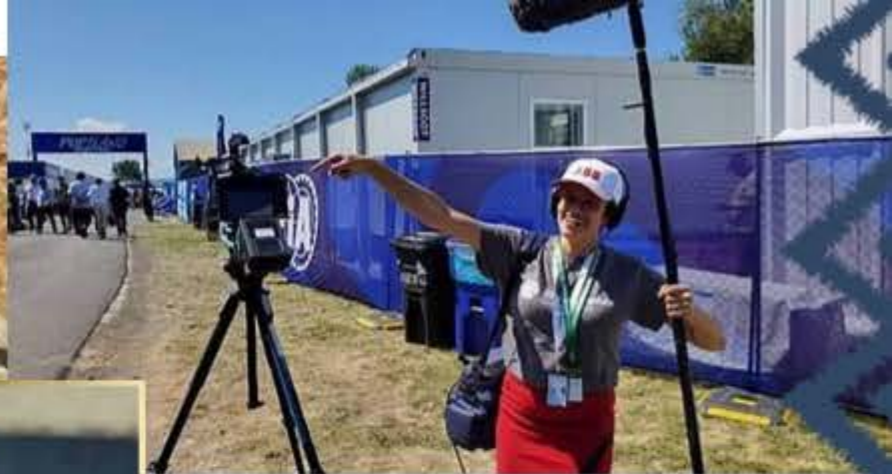
Working at an event at the Portland International Raceway