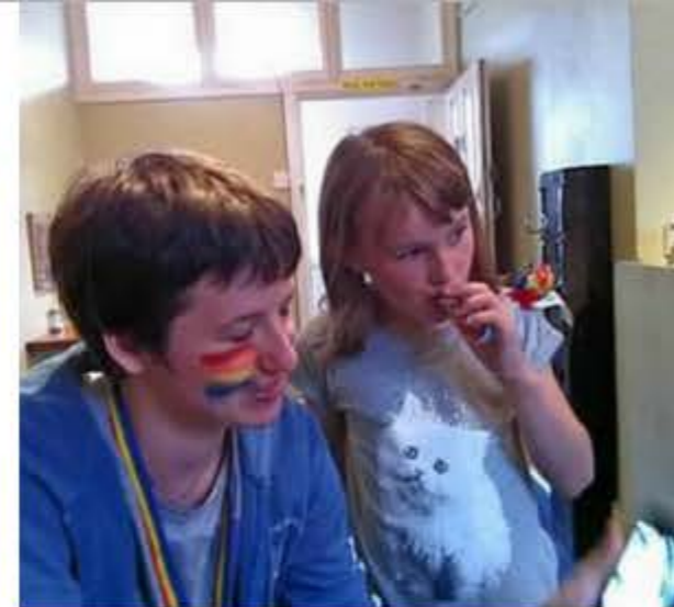
Hanging out with our friends' daughter after Bristol Pride.