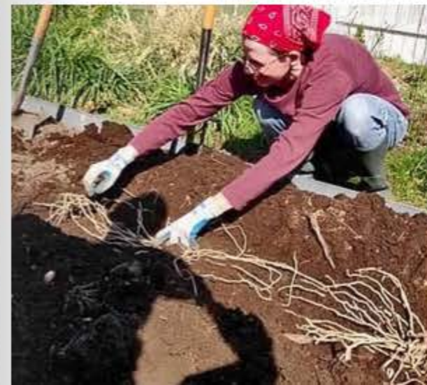
Planting asparagus in our garden.