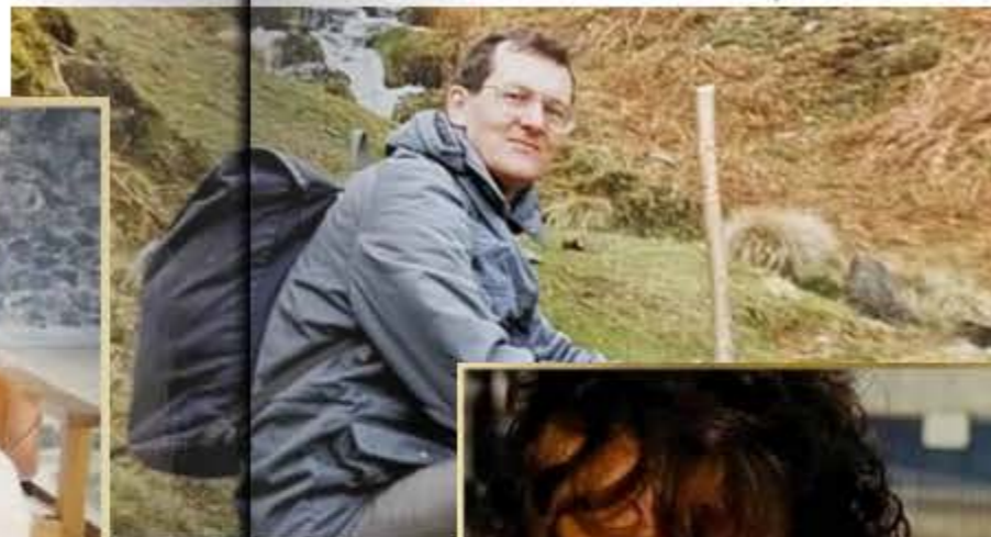
Daddy in the Lake District