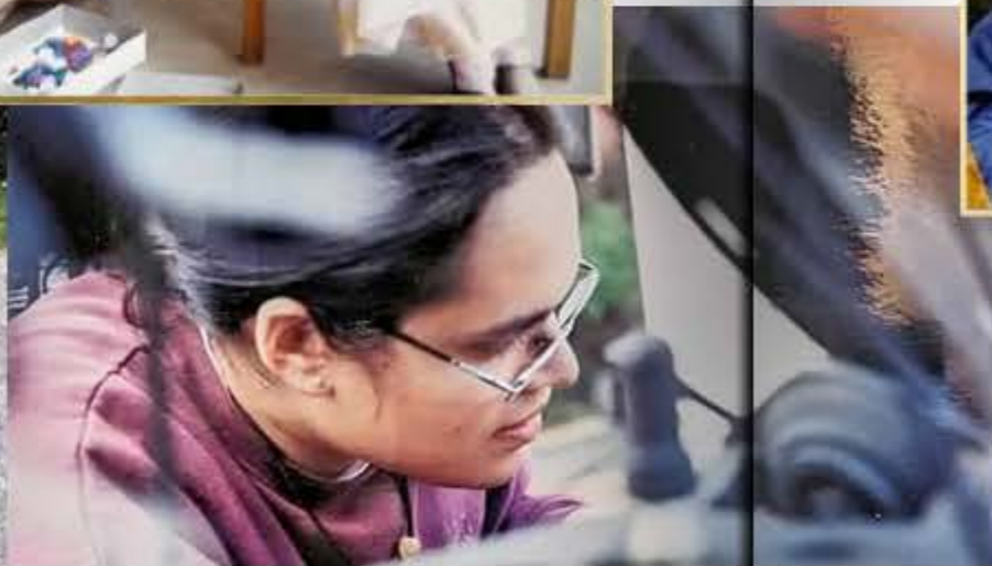
Fixing my motorbike.

My family always encouraged curiosity and interest in the world, along with a love of reading and music. I still love listening to music (and sometimes choose to relive being woken early by my mother's Abba albums), and still love reading.