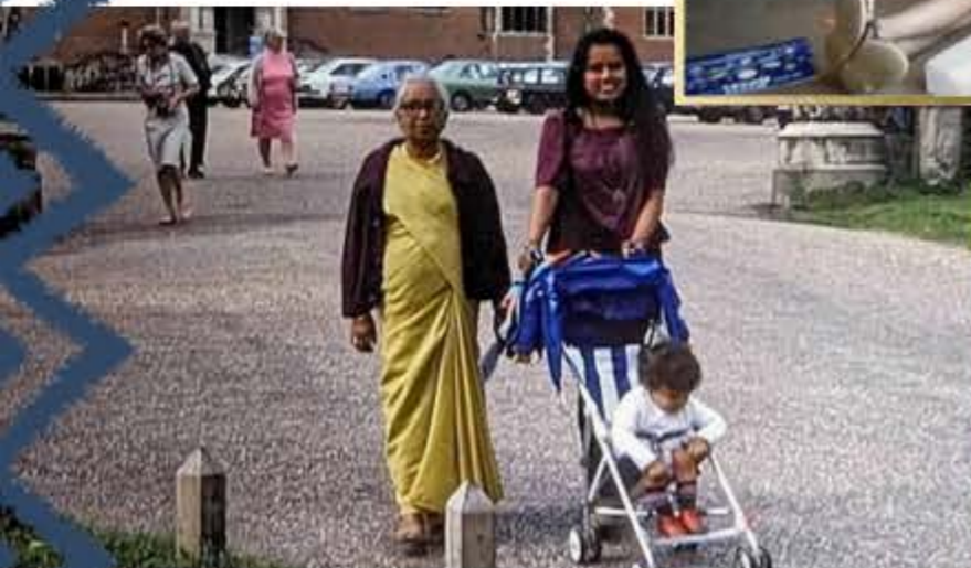
My grandmother visited England once. Here she is with my mother and me.