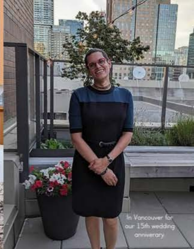
In Vancouver for our 15th wedding anniversary