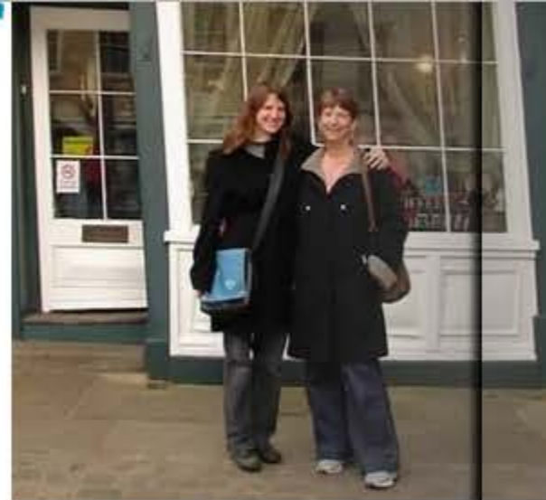
With Mom in Windsor, UK.