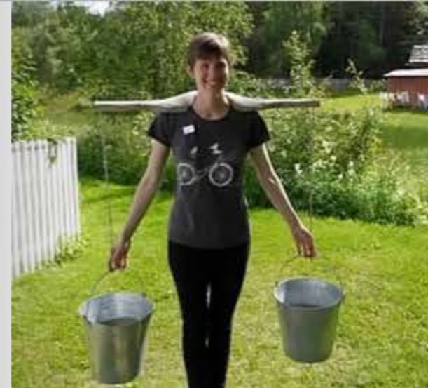
At a folk life museum in Norway.