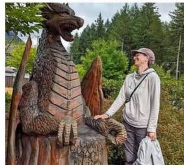
Enjoying a dragon on Vancouver Island.