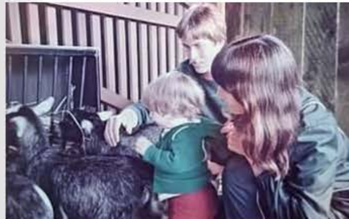
Meeting goats with my parents.