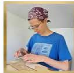
Working on our media cabinet.