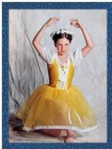
Posing for my ballet class photo.