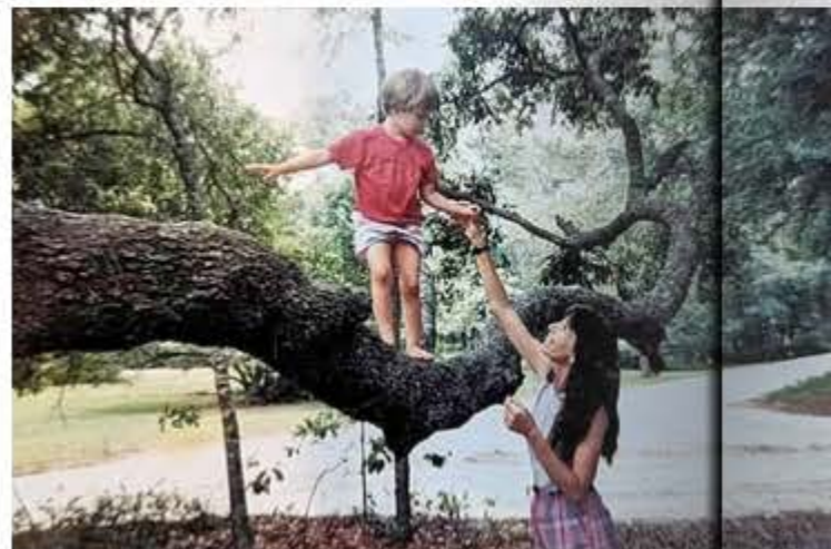
Climbing trees in Florida with Mom.