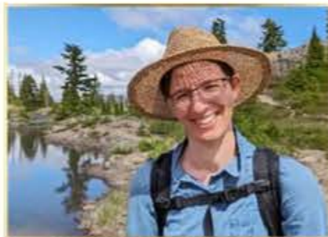
Hiking in Strathcona Provincial Park.