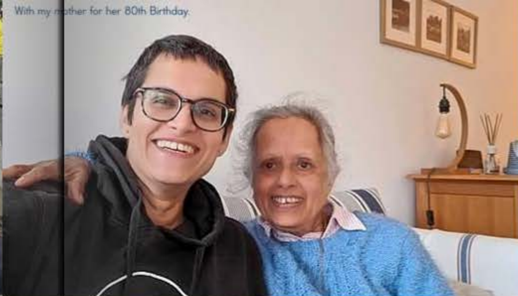
With my mother for her 80th Birthday.