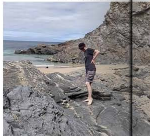
On the beach in Cornwall.