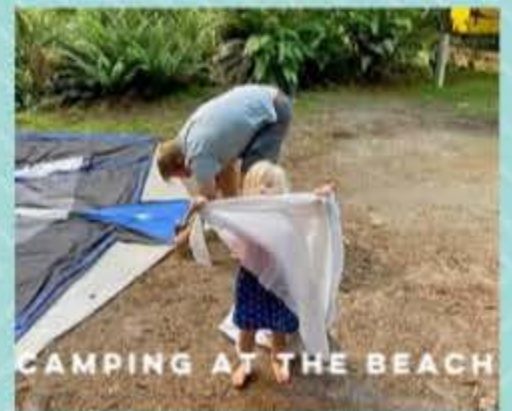
CAMPING AT THE BEACH