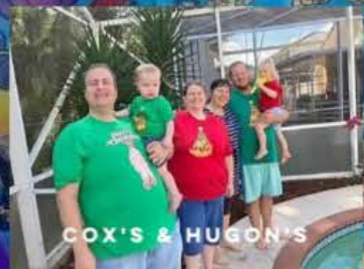
COX'S & HUGON'S