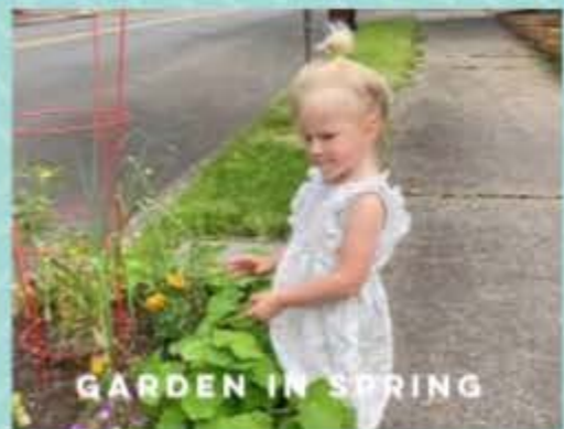
GARDEN IN SPRING