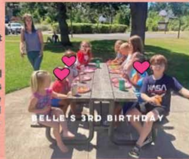
BELLE'S 3RD BIRTHDAY