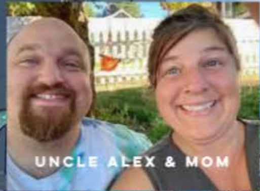
UNCLE ALEX & MOM