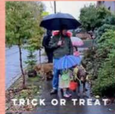
TRICK OR TREAT