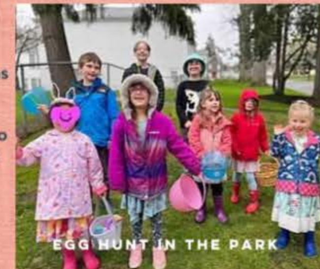
EGG HUNT IN THE PARK