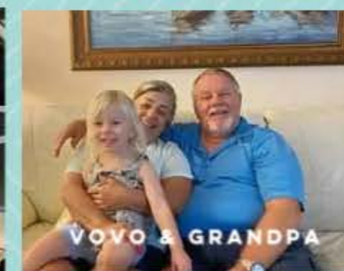
VOVO & GRANDPA