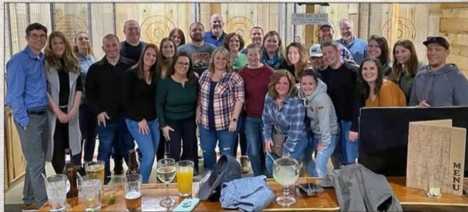
We went axe throwing for my birthday this year! What a blast! These are many of my work-friends and their spouses.

I have been an athlete all of my life, and truly loved being coached. I loved coaching the girls' volleyball program at MRHS. In some ways, now my role is still to coach, but instead of coaching athletes on a court, I often feel like I am "coaching" the high school students and teachers with whom I spend my days at school. I find this to be some of the most rewarding experiences in my adult life, when I can positively guide, mentor and influence others and see them celebrate their successes in the process.