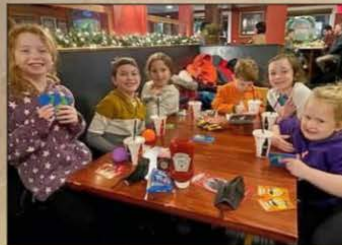
New Year's Eve in North Conway, NH with all the kids!