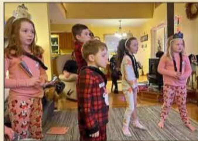
When we got back to the house, the kids had a dance party and did their own kids' countdown to celebrate the new year!