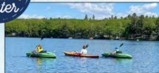
These pictures were taken at our dock in Maine to kick off the summer of 2022.