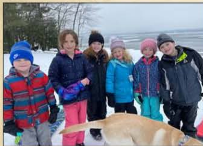
After our adventure on a horse-drawn carriage, we had an EPIC spontaneous evening snowball fight right there in the snow.