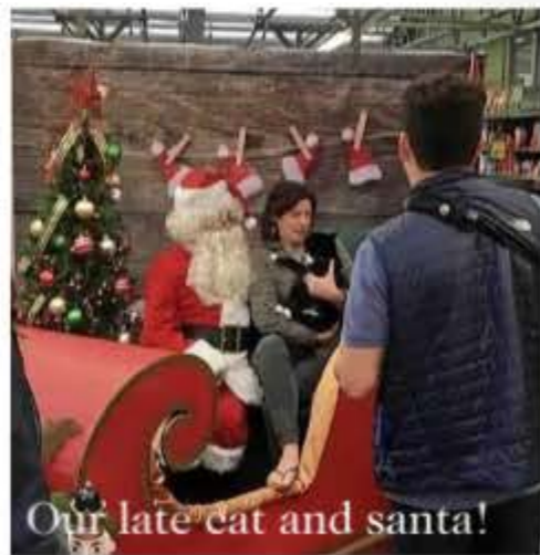
Our late cat and santa!