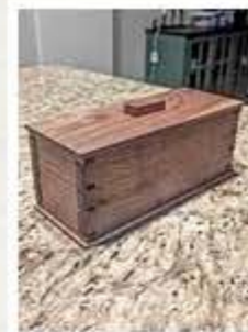
Above: Some of the projects I have completed. I try to stick to old fashioned methods to make things, using hand planers, chisels, and hand saws