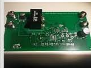
Circuit Board I designed to do power conversion

Woodworking, Gardening, Cooking, Tinkering with Electronics