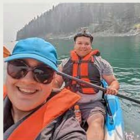
Kayaking in Joseph, OR