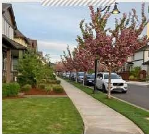
One of the many playgrounds throughout our neighborhood

We enjoy our neighborhood and the connection with our neighbors. Our neighborhood is home to multiple parks, basketball courts, nature trails, and bike trails that we like to visit.