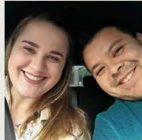
On a Road Trip!