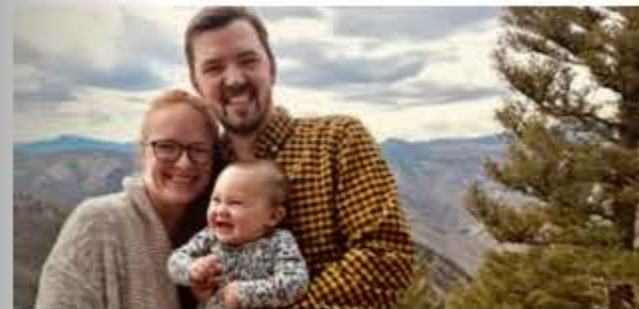
Annual trips to Hawaii and Colorado to visit family and friends